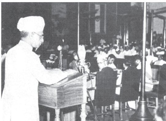
Sarvepalli Radhakrishnan addressing the Constituent Assembly

Read both the Karachi Resolution and the Preamble carefully. Identify the key ideas that exist in it.