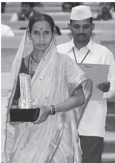
A woman Panch with her reward

importantly, control of local resources is given to the elected local bodies.