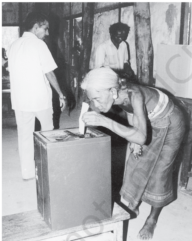
An old lady voting in election

Both the procedures as well as the values that form Indian democracy have developed over the long years of India's anti-colonial struggle. In the last 70 years, since Independence, the success of Indian democracy has been seen as a remarkable feat for a country with such great diversity as well as inequality. This chapter cannot possibly provide a comprehensive account of its rich and complex past and present.