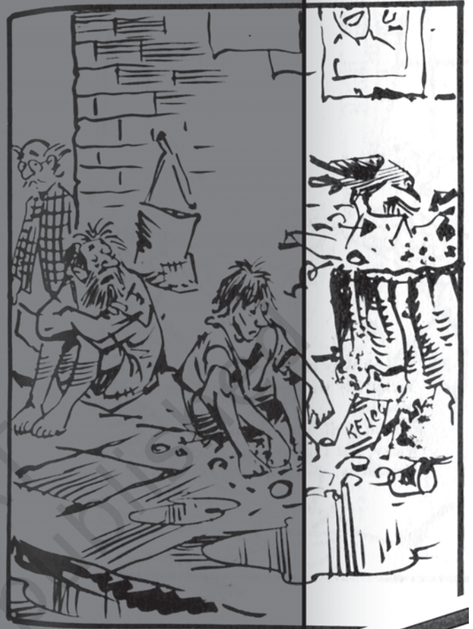
Be careful about what you of poisoning around

s tion was a major media affair. And their elegant paintings and curtains