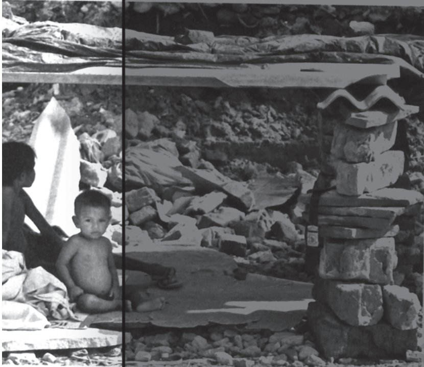
in their demolished house, in New Delhi on July 31.

tries and State these funds must invariably certifying the dates be transferred to panchayats amounts of local gran