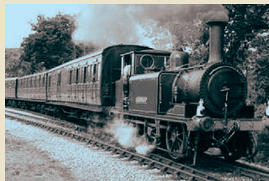
First Train: Bombay(Mumbai) to Thane

The railway line from Bombay to Thane was opened in 1853; from Howrah to Raniganj in 1854-55. The first railway line in south India ran from Madras to Arakonam in 1856. Royapuram was one of the railway stations inaugurated in that year.