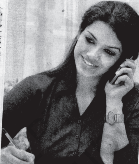
costlier services like Net phone are shunned. Women are champion text messagers.

We love short messaging services, indeed 100 per cent