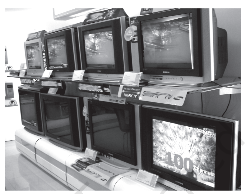
A television showroom

In 1991 there was one state controlled TV channel Doordarshan in India. By 1998 there were almost 70 channels. Privately run satellite channels have multiplied rapidly since the mid-1990s. While Doordarshan broadcasts over 35 channels there were about 900 private television networks broadcasting in 2020. staggering growth of private satellite television has been one of the developments defining contemporary India. In 2002, 134 million individuals watched satellite TV on an average every week. This