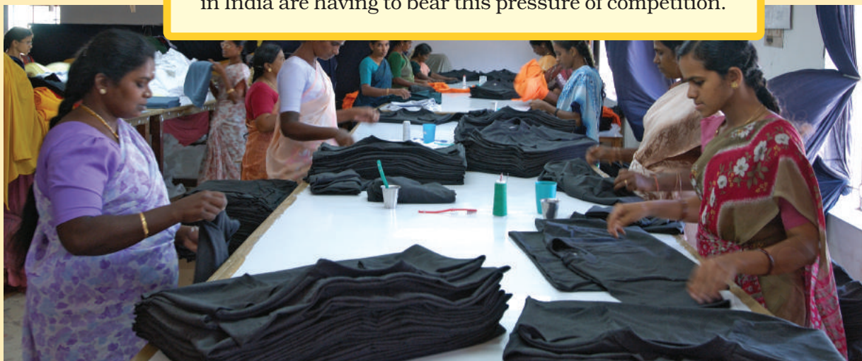
Factory workers folding garments for export. Though globalisation has created opportunities for paid work for women, the condition of employment shows that women are denied their fair share of benefits.

Let us see how the workers in the garment export industry in India are having to bear this pressure of competition.