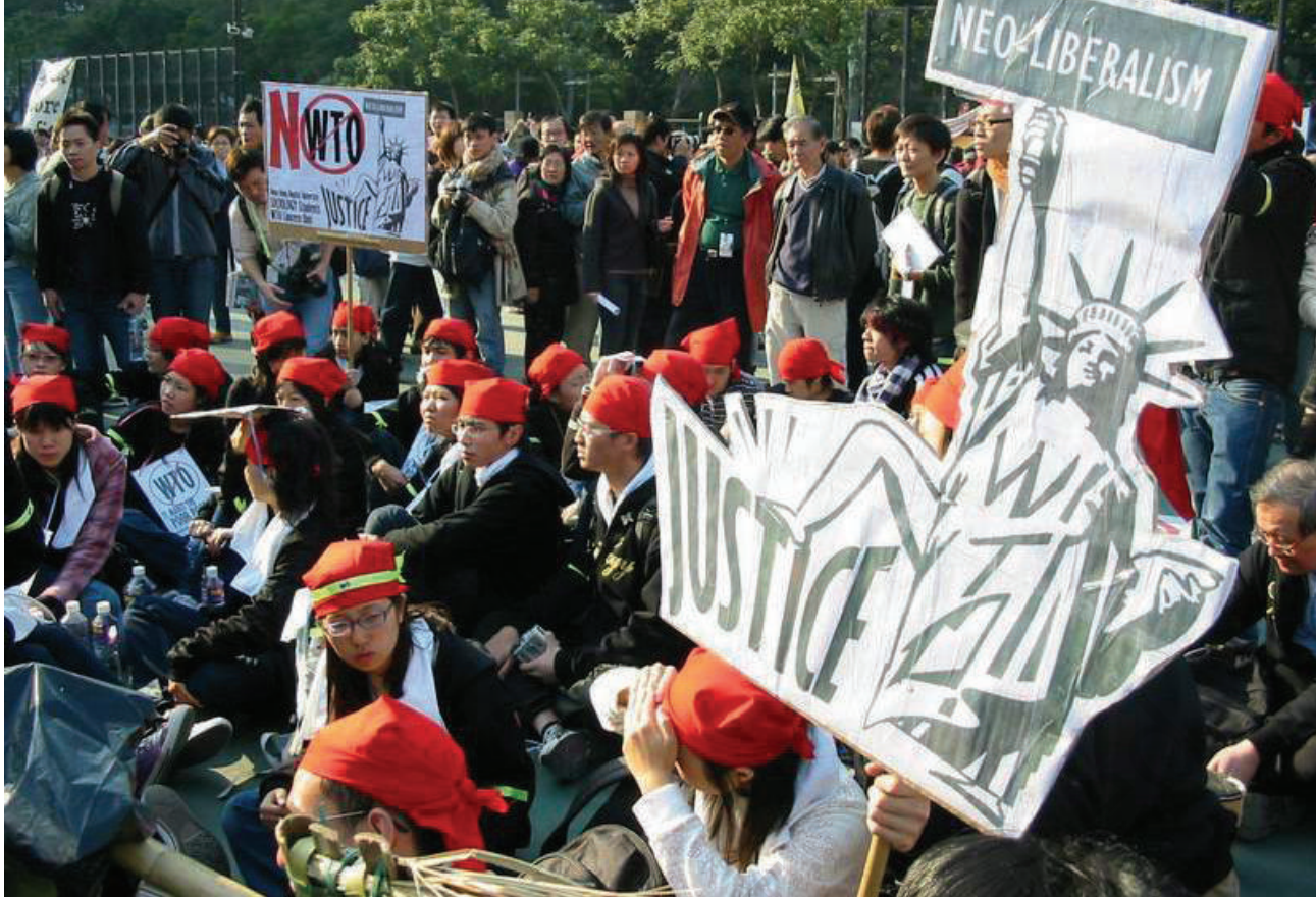
A demonstration against WTO in Hong Kong, 2005