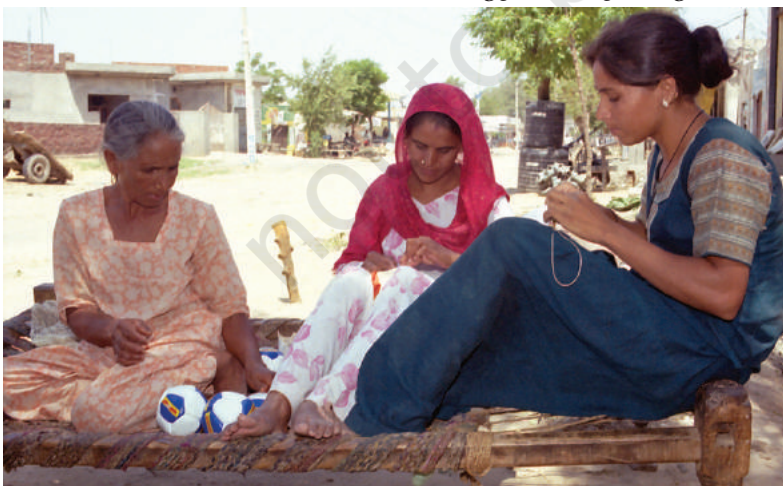
Women at home in Ludhiana making footballs for large MNCs

There's another way in which MNCs control production. Large MNCs in developed countries place orders for production with small producers. Garments, footwear, sports items are examples of industries where production is carried out by a large number of small producers around the world.