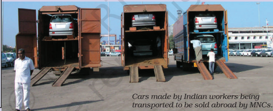
Cars made by Indian workers being transported to be sold abroad by MNCs.