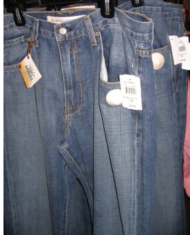
Jeans produced in developing countries being sold in USA for Rs 6500 ($145)

The products are supplied to the MNCs, which then sell these under their own brand names to the customers. These large MNCs have tremendous power to determine price, quality, delivery, and labour conditions for these distant producers.