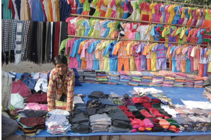
Small traders of readymade garments facing stiff competition from both the MNC brands and imports.

In general, with the opening of trade, goods travel from one market to another. Choice of goods in the markets rises. Prices of similar goods in the two markets tend to become equal. And, producers in the two countries now closely compete against each other even though they are separated by thousands of miles! Foreign trade thus results in connecting the markets or integration of markets in different countries.