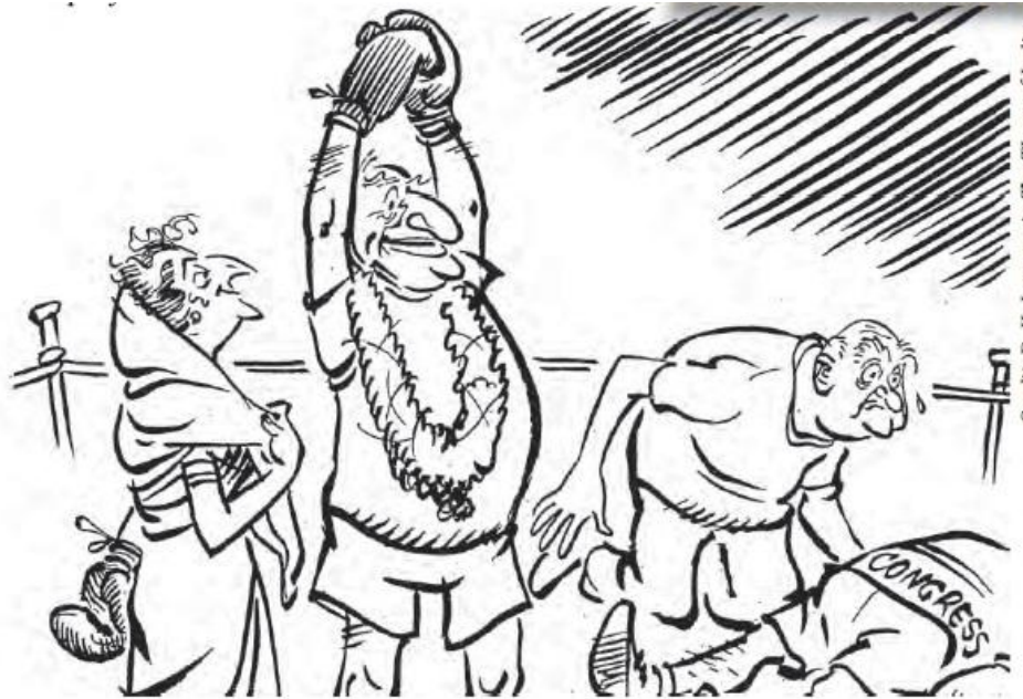
"The Left Hook" was published after the victory of V.V. Giri, (the boxer with the garland) over the nominee of the Syndicate, represented here by Nijalingappa (on his knees).

20. See the cartoon given below and answer the questions which follow: