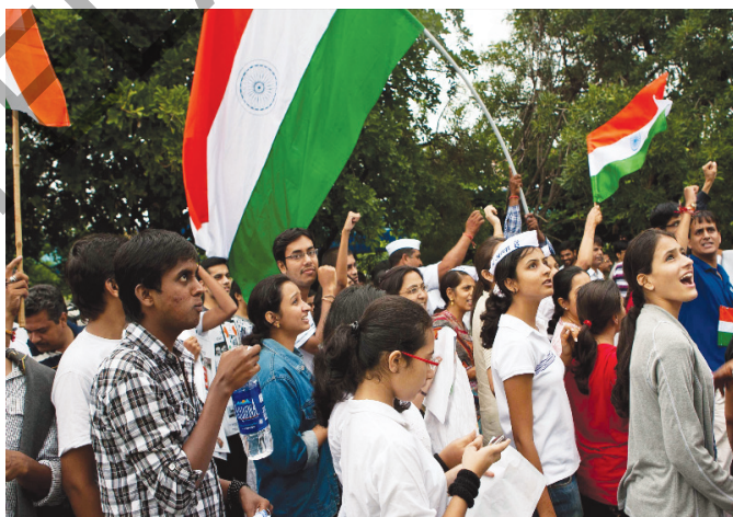
Fig. 19.2: A rally

However, there are some restrictions on this right – for example, any assembly should be conducted in a peaceful manner without the display or use of arms. Similarly, whenever a demonstration or a rally is organised, prior permission from the administration needs to be taken.