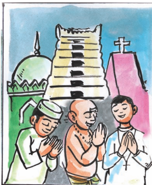
Fig. 19.3: Places of worship and people of different religions

All individuals are free to follow their conscience and practise any religion. No one can be prohibited from following his or her religious practices as an individual. This also means that a person can decide to change his or her religion.