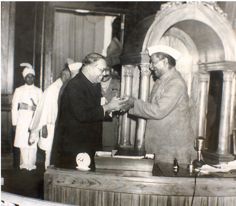
Fig. 15. 9 B. R. Ambedkar and Rajendra Prasad greeting each other at the time of the handing over of the Constitution

The Constituent Assembly debates help us understand the many conflicting voices that had to be negotiated in framing the Constitution, and the many demands that were articulated. They tell us about the ideals that were invoked and the principles that the makers of the Constitution operated with. But in reading these debates we need to be aware that the ideals invoked were very often re-worked according to what seemed appropriate within a context. At times the members of the Assembly also changed their ideas as the debate unfolded over three years. Hearing others argue, some members rethought their positions, opening their minds to contrary views, while others changed their views in reaction to the events around.