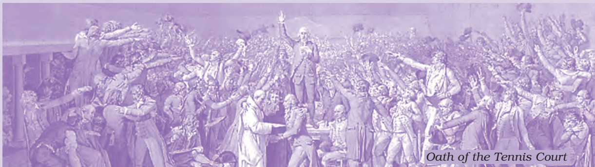
Oath of the Tennis Court

CONSTITUENT ASSEMBLY DEBATES (CAD), VOL. I