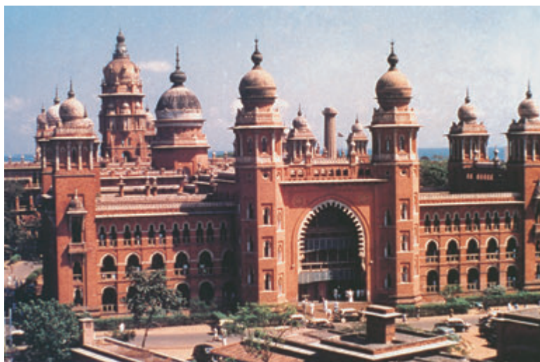
High Court of Madras http://www.hcmadras.tn.nic.in

High Courts were first established in the three Presidency cities of Calcutta, Bombay and Madras in 1862. The High Court of Delhi came up in 1966. Currently there are 25 High Courts. While many states have their own High Courts, Punjab and Haryana share a common High Court at Chandigarh, and four North Eastern states of Assam, Nagaland, Mizoram and Arunachal Pradesh have a common High Court at Guwahati. Andhra Pradesh (Amaravati) and Telangana (Hyderabad) have separate High Courts from 1 January 2019. Some High Courts have benches in other parts of the state for greater accessibility.