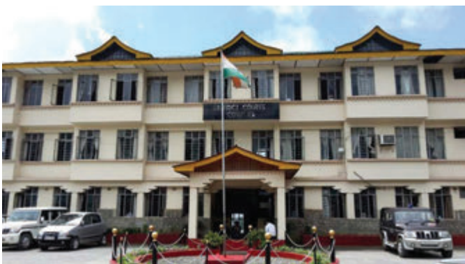
District Courts Complex in Namchi, South Sikkim http://districtcourtsnamchi.nic.in

Write two sentences of what you understand about the appellate system from the given case.