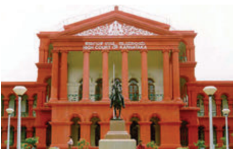
High Court of Karnataka http://karnatakajudiciary.kar.nic.in

Let us understand what we mean by the appellate system by tracking a case, State (Delhi Administration) vs Laxman Kumar and Others (1985) , from the lower courts to the Supreme Court.