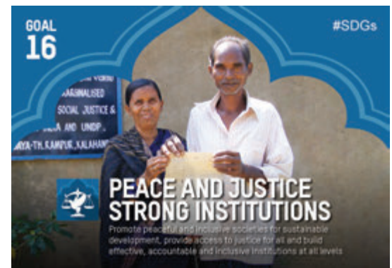
Sustainable Development Goal (SDG) www.in.undp.org

There are three different levels of courts in our country. There are several courts at the lower level while there is only one at the apex level. The courts that most people interact with are what are called subordinate or district courts. These are usually at the district or Tehsil level or in towns and they hear many kinds of cases. Each state is divided into districts that are presided over by a District Judge. Each state has a High Court which is the highest court of that state. At the top is the Supreme Court that is located in New Delhi and is presided over by the Chief Justice of India. The decisions made by the Supreme Court are binding on all other courts in India.