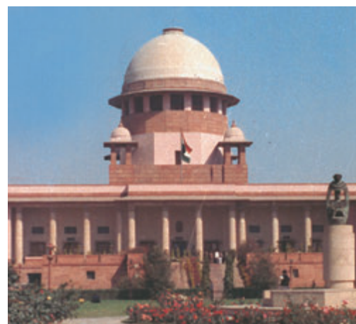
Supreme Court of India https://www.sci.gov.in