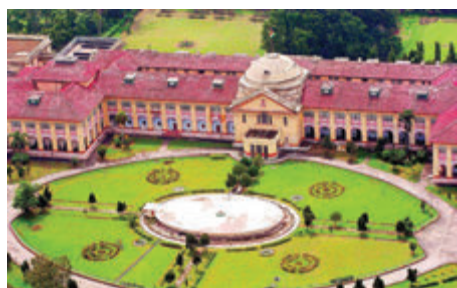
High Court of Patna http://patnahighcourt.gov.in

Are these different levels of courts connected to each other? Yes, they are. In India, we have an integrated judicial system, meaning that the decisions made by higher courts are binding on the lower courts. Another way to understand this integration is through the appellate system that exists in India. This means that a person can appeal to a higher court if they believe that the judgment passed by the lower court is not just.