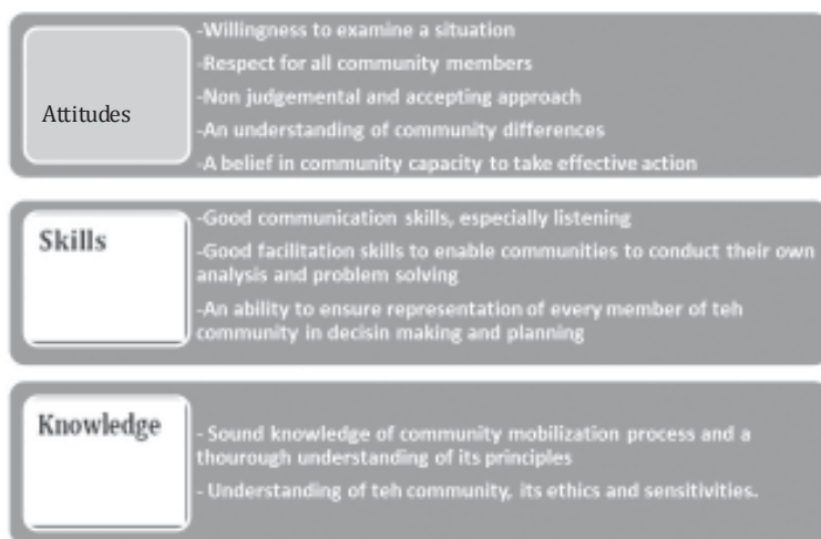
Figure 1: Attitudes, Skills and Knowledge important for a Community Mobilizer

Figure 1 summarizes the attitudes, skills and knowledge that a community mobilizer should have.