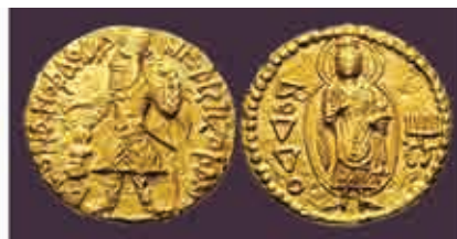
Gold coin of Kanishka

In the Kushana period, Buddhism reached China by this trade route. Some of the coins of emperor Kanishka carry the image of