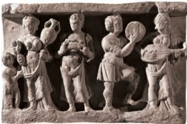
A Sculpture from a stupa at Hadda

The ancient 'Nagarhar', modern 'Hadda' near Jalalabad in Afghanistan was another important centre of Buddhism. There are several remains of stupas and viharas scattered over the place. The sculptures found around the stupas are excellent specimens of Gandhara style. 'Takht-i-Bahi' is another important place, which is enlisted as 'World Cultural Heritage'. It is in the Pakhtunkhwa province of Gandhara region. It is a part of Pakistan now.