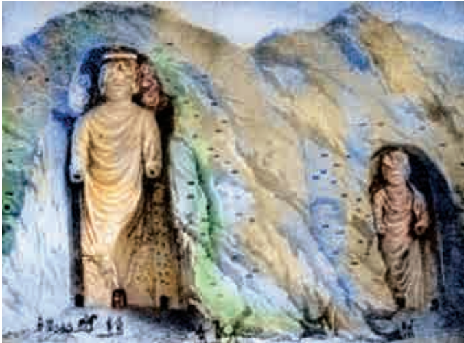
Bamiyan Buddha images

Some images of Hindu gods and goddesses have also been found in Afghanistan. Among them is an image of Ganesha found near the city of Kabul. This image is dated to 4 th century C.E. and it is the earliest image among the extant Ganesha images. It may be noted that even in India an image of Ganesha, as ancient as this one is not found. There is one temple called 'Khair Khana' near Kabul. The excavations at this site have yielded an image of God Surya mounted on a chariot.