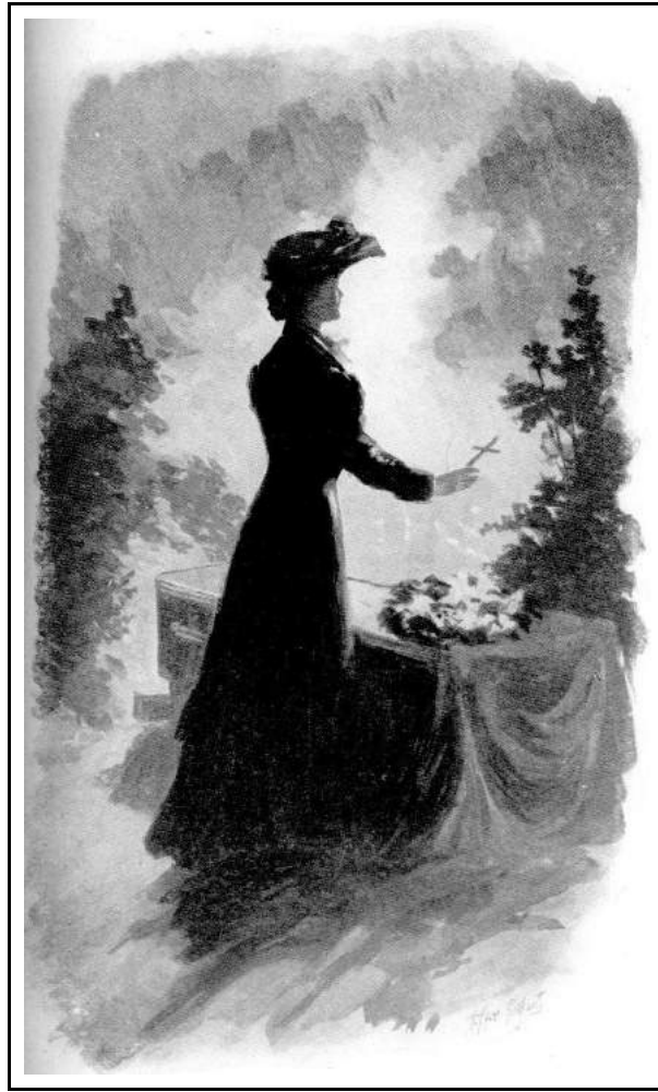
"THE MOON CAME OUT FROM BEHIND A CLOUD"

stepped forward, and laid on it a large cross made of white and pink almond-blossoms. As she did so, the moon came out from behind a cloud, and flooded with its silent silver the little churchyard, and from a distant copse a nightingale began to sing. She thought of the ghost's description of the Garden of Death, her eyes became dim with tears, and she hardly spoke a word during the drive home.