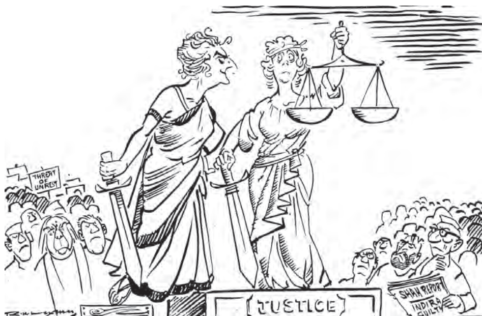
Mrs. Gandhi's confrontation with the Shah Commission provoked this cartoon when the commission's report was released.

Indira Gandhi Addressing the nation on All India Radio on 26 June 1975