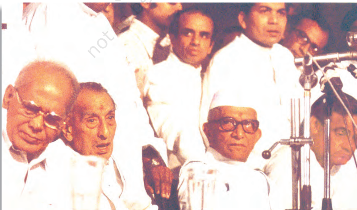
Oath taking by the first non-congress government at the centre in 1977. In the picture are Jayaprakash Narayan, J. B. Kriplani, Morarji Desai and Atal Behari Vajpayee.

The Janata Party government that came to power after the 1977 elections was far from cohesive. After the election, there was stiff competition among three leaders for the post of Prime Minister – Morarji Desai, who