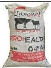
Balanced diet including nutrients and roughage