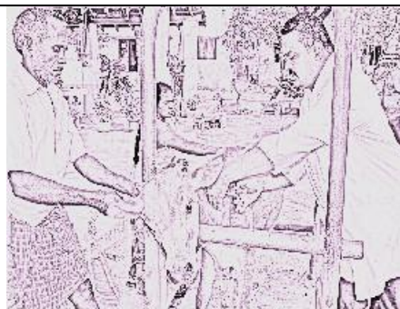
Periodic visit by veterinarian and proper immunization schedule