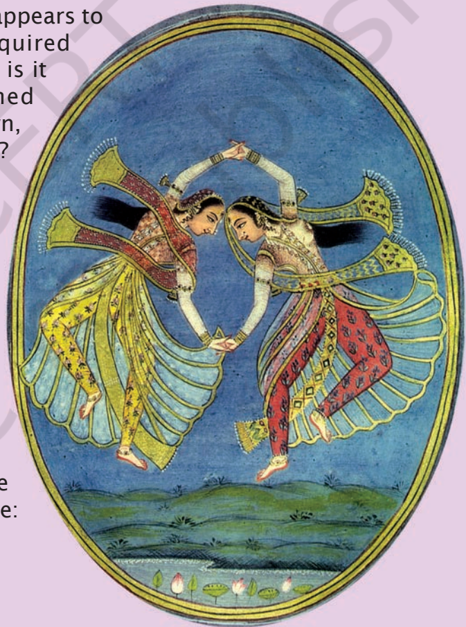
Fig. 6 Kathak dancers, a court painting.