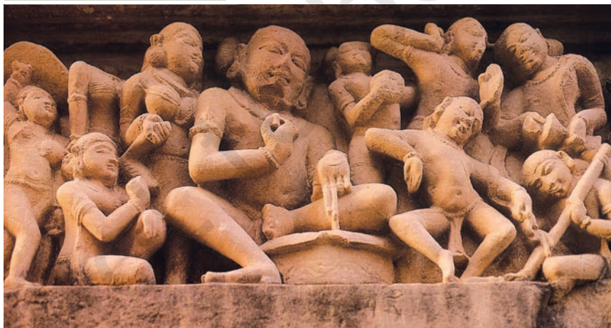
Fig. 5 Dance class, Lakshmana temple, Khajuraho.

of the nineteenth century it was firmly entrenched as a dance form not only in these two regions, but in the adjoining areas of present-day Punjab, Haryana, Jammu and Kashmir, Bihar and Madhya Pradesh. Emphasis was laid on intricate and