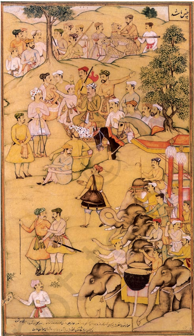
Fig. 7 Akbar resting during a hunt, Mughal miniature.

Another region that attracted miniature paintings was the Himalayan foothills around the modern-day state of Himachal