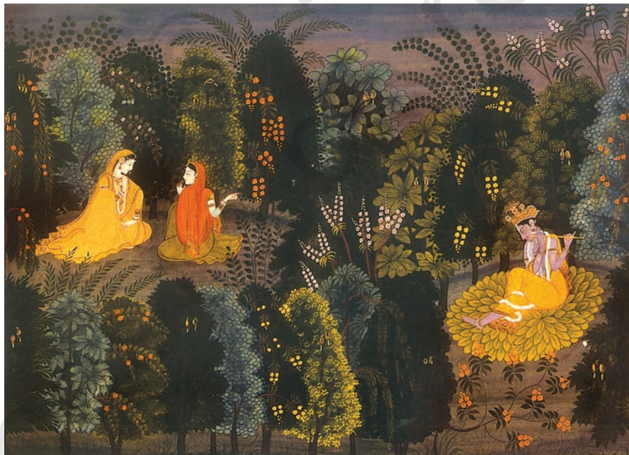
Fig. 9 Krishna, Radha and her companion, Pahari miniature, Kangra.

Pradesh. By the late seventeenth century this region had developed a bold and intense style of miniature painting called Basohli. The most popular text to be painted here was Bhanudatta's Rasamanjari . Nadir Shah's invasion and the conquest of Delhi in 1739 resulted in the migration of Mughal artists to the hills to escape the uncertainties of the plains. Here