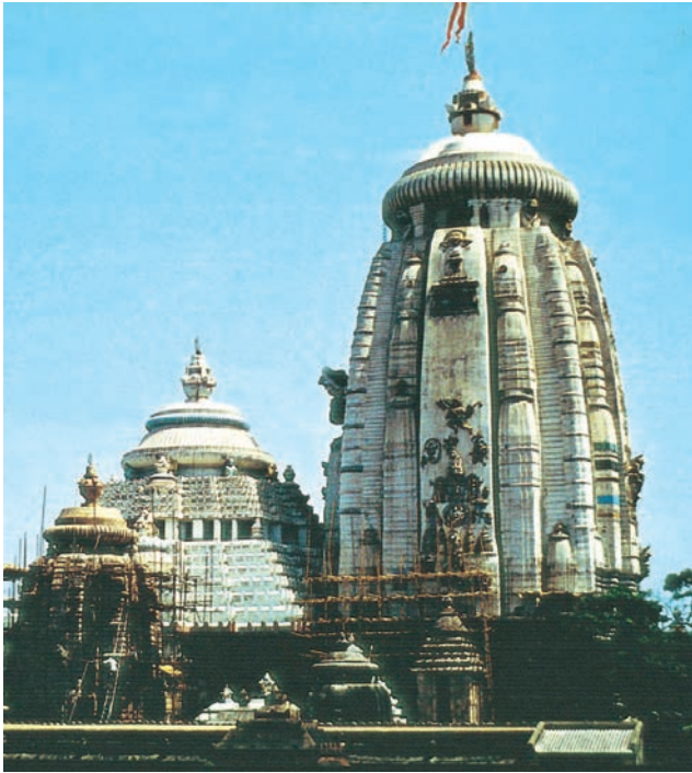
Fig. 3 Jagannatha temple, Puri.

As the temple gained in importance as a centre of pilgrimage, its authority in social and political matters also increased. All those who conquered Orissa, such as the Mughals, the Marathas and the English East India Company, attempted to gain control over the temple. They felt that this would make their rule acceptable to the local people.