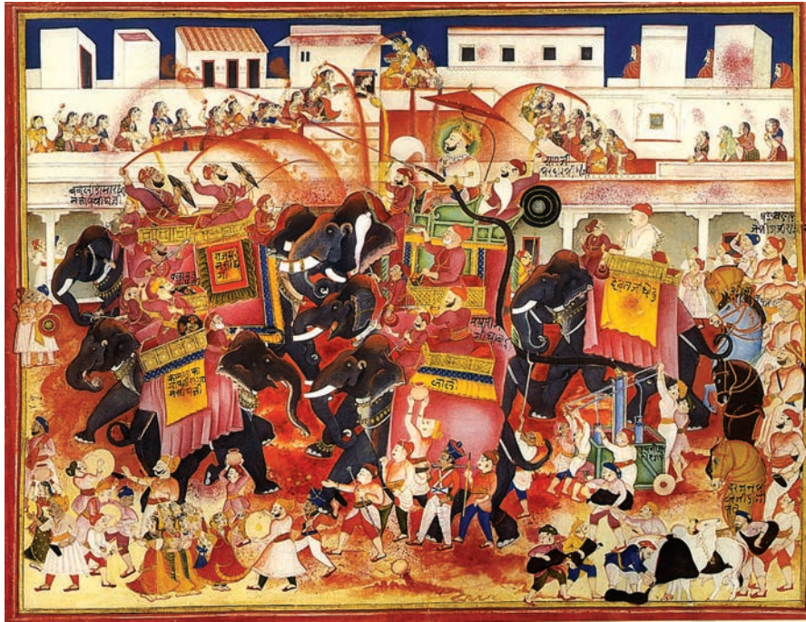
Fig. 8 Maharana Ram Singh II playing holi. Rajput miniature, Kota.

Pradesh. By the late seventeenth century this region had developed a bold and intense style of miniature painting called Basohli. The most popular text to be painted here was Bhanudatta's Rasamanjari . Nadir Shah's invasion and the conquest of Delhi in 1739 resulted in the migration of Mughal artists to the hills to escape the uncertainties of the plains. Here