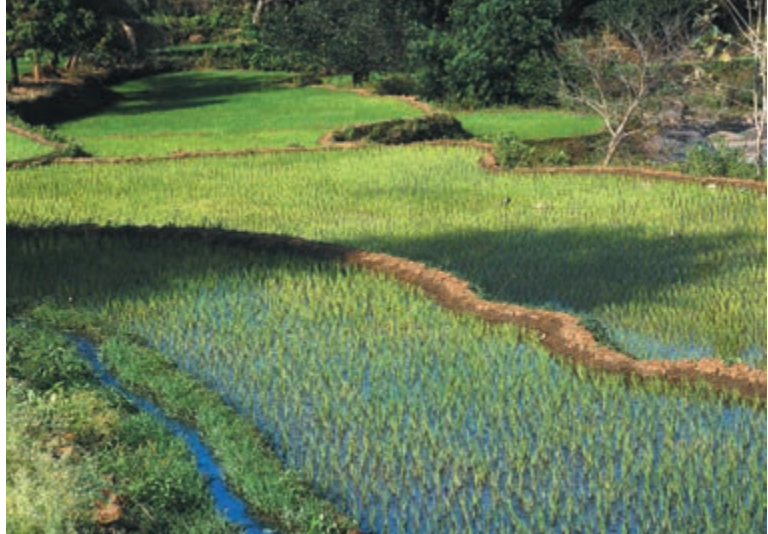
Transplanted paddy growing in a few of Ramalingam's 20 acres. A result of hard labour performed by agricultural workers like Thulasi.

This is when we can say they are caught in debt. In recent years this has become a major cause of distress among farmers. In some areas this has also resulted in many farmers committing suicide.