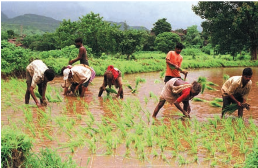
Transplanting paddy is back-breaking work.

The village is surrounded by low hills. Paddy is the main crop that is grown in irrigated lands. Most of the families earn a living through agriculture.