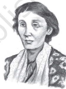
Virginia Woolf 1882-1941

This essay records fleeting impressions and delicate shades of mental experience.