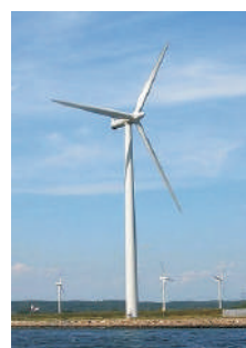
Fig. 12.5 Windmill