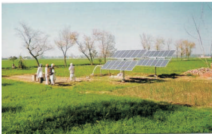
Fig. 12.2 Photovoltaic Water Pumping

Sun is one of the most powerful renewable sources of energy for the future. As long as the sun exists, we will continue to get its energy. About 30% of the incoming solar radiation is absorbed by the upper atmospheres, the rest is absorbed by the land, sea and clouds.