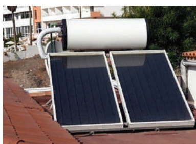
Fig. 12.3 Solar flat plate collector

Solar energy is used commonly for heating, cooking, production of electricity, and even in the desalination of seawater. With the help of solar cells, solar energy is converted into electricity. One of the most common uses of the sun's energy has been for water heating systems. It is also used to provide power to the vehicles, generate electricity, lighting streets, cooking etc. On a small scale, solar energy is being used to heat up water for daily use in our homes and also the swimming pools. On a larger scale, solar energy could be used to run cars, power plants, and space ships etc.