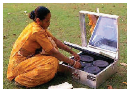
Fig. 12.4 Box type solar cookers