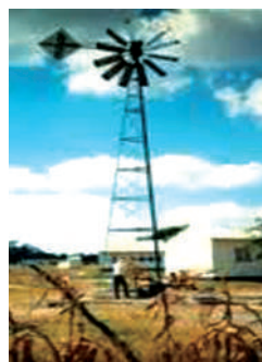
Fig. 12.6 Phirki