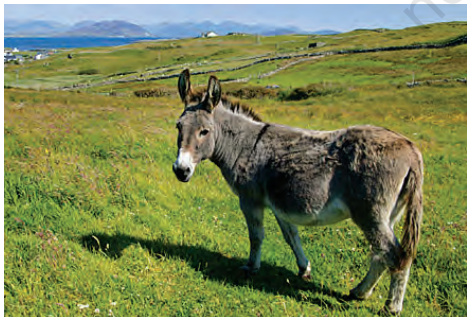
Figure 9.2 Mule

Controlled breeding experiments are carried out using artificial insemination . The semen is collected from the male that is chosen as a parent and injected into the reproductive tract of the selected female by the breeder. The semen may be used immediately or can be frozen and used at a later date. It can also be transported in a frozen form to where the female is housed. In this way desirable matings are carried. Artificial insemination helps us overcome several problems of normal matings. Can you discuss and list some of them?