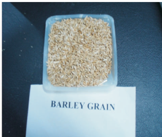
Fig. 1.2 Barley grain, CP=8%, TDN=70%.