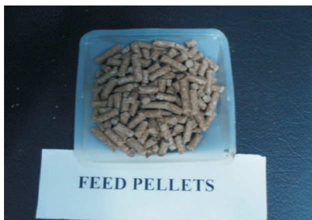
Fig. 1.7. Compound pelleted feed, CP=20%, TDN=75%