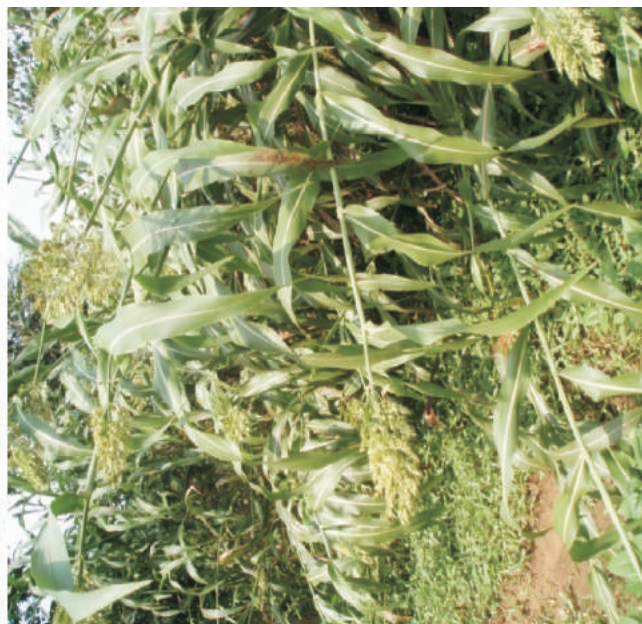
Fig. 1.9. Sorhum, CP=7%, TDN=55%, Fresh forage yield= 350-500q/ha