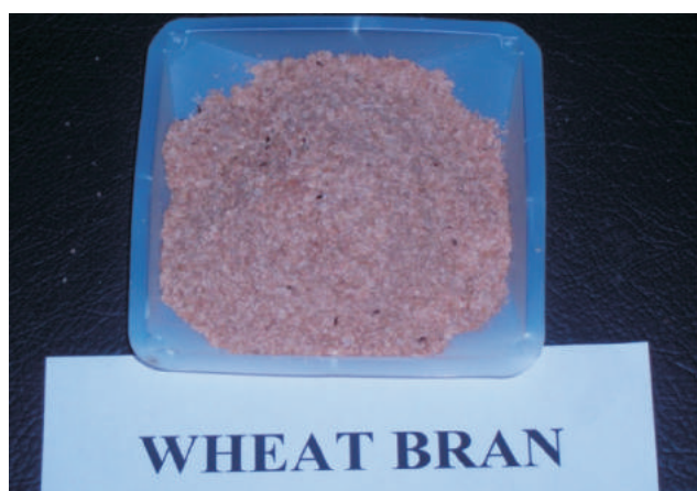
Fig. 1.5. Wheat bran, CP=15%, TDN=65%