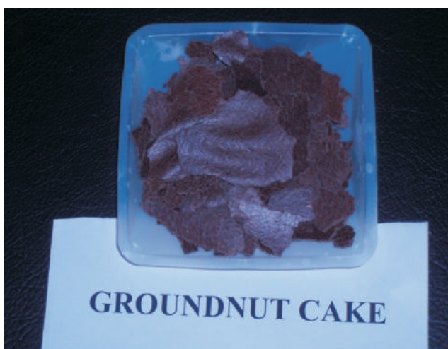
Fig. 1.3 Groundnut cake, CP=45%, TDN=78%