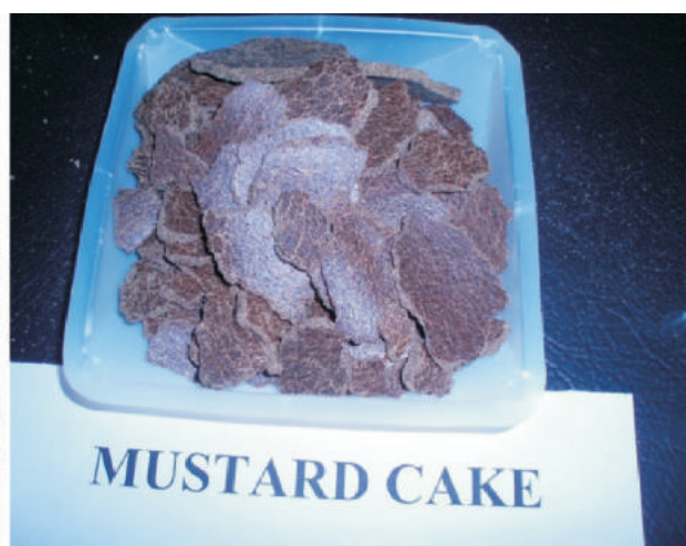
Fig. 1.4. Mustard cake, CP=35%, TDN=80%