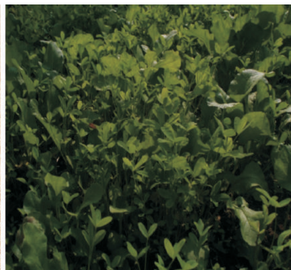
Fig. 1.11. Berseem, CP=18%, TDN=62% Fresh forage yield= 500-1000q/ha