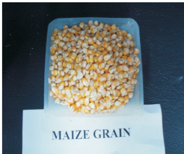
Fig. 1. Maize grain, CP=11%, TDN=84%.