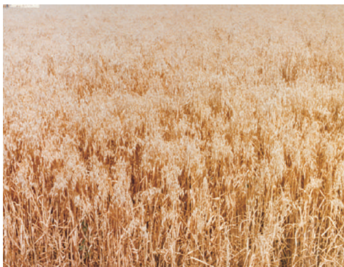
Fig. 1.10 Oats, CP=10%, TDN=60% Fresh forage yield=250-425q/ha