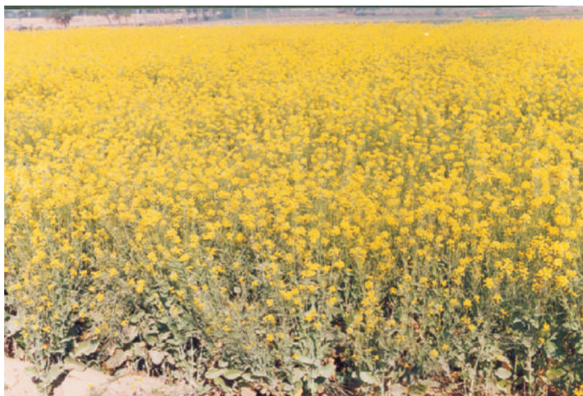
Fig. 1.12 Chinese cabbage, CP=145, TDN=60%, Fresh forage yield=200-350q/ha