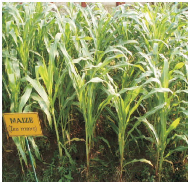
Fig. 1.8 Maize green, CP=9%, TDN=60% Fresh forage yield= 350-500q/ha