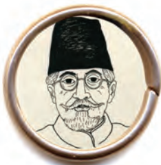
Abul Kalam Azad (1888-1958)

born: Saudi Arabia. Educationist, author and theologian; scholar of Arabic. Congress leader, active in the national movement. Opposed Muslim separatist politics. Later: Education Minister in the first union cabinet.