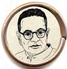
T.T. Krishnamachari (1899-1974)

born: Saudi Arabia. Educationist, author and theologian; scholar of Arabic. Congress leader, active in the national movement. Opposed Muslim separatist politics. Later: Education Minister in the first union cabinet.