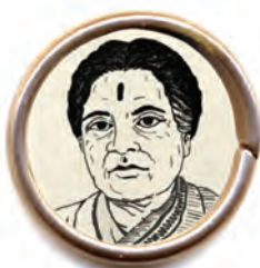
G. Durgabai Deshmukh (1909-1981)

born: Andhra Pradesh. Advocate and public activist for women's emancipation. Founder of Andhra Mahila Sabha. Congress leader. Later: Founder Chairperson of Central Social Welfare Board.