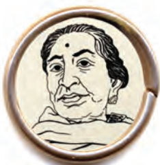
Sarojini Naidu (1879-1949) born: Andhra Pradesh. Poet, writer and political activist. Among the foremost women leaders in the Congress. Later: Governor of Uttar Pradesh.