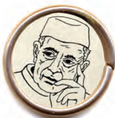
Jawaharlal Nehru (1889-1964) born: Uttar Pradesh. Prime Minister of the interim government. Lawyer and Congress leader. Advocate of socialism, democracy and anti-imperialism. Later: First Prime Minister of India.