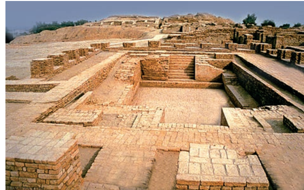
The Great Bath

are identified as granary. The bricks were laid watertight with gypsum mortar. It had drainage. It is associated with ritual bathing.