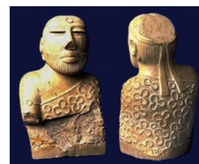
The priest king

The terracotta figurines, the paintings on the pottery, and the bronze images from the Harappan sites suggest the artistic nature of the Harappans.