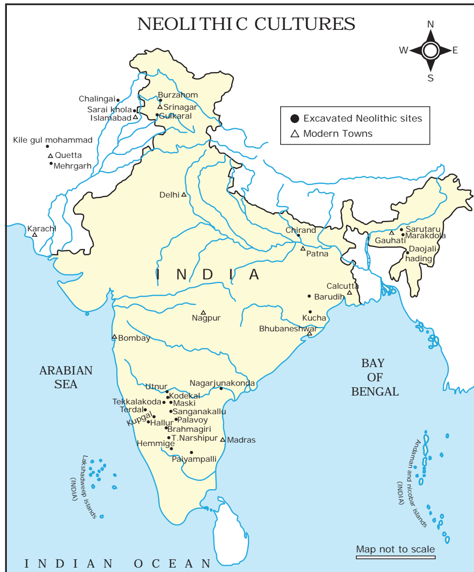
Neolithic sites of India

The period II at Mehrgarh dates from c. 5500 to 4800 BCE and the period III from 4800 to 3500 BCE. There is evidence for pottery during these periods. Terracotta figurines and glazed faience beads have been found. Evidence for ornaments on women has been uncovered. Long-distance trade was practiced, as revealed by Lapis Lazuli, which is available only in Badakshan. The town was abandoned after the rise of mature phase of the Indus Civilisation.