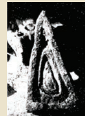
Similar stone in a contemporary shrine

beads have been found at Jwalapuram in Andhra Pradesh, Patne in Maharashtra and Batadomba-Lena and Fa Hien Cave in Sri Lanka.