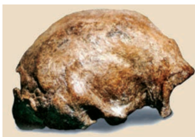
Hathnora archaic Homo sapiens fossil skull fragment