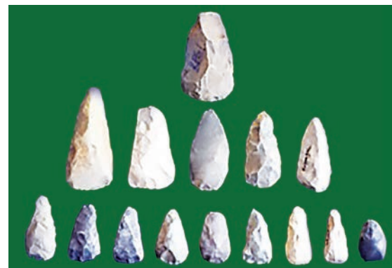
Neolithic ground stone axe