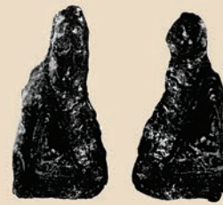
Triangular stone from upper palaeolithic shrine

An interesting find is of a possible shrine, indicated by a block of sandstone surrounded by a rubble circle, similar to the contemporary shrines. Found at Baghor in Uttar Pradesh, it is the earliest known evidence of a shrine in India.