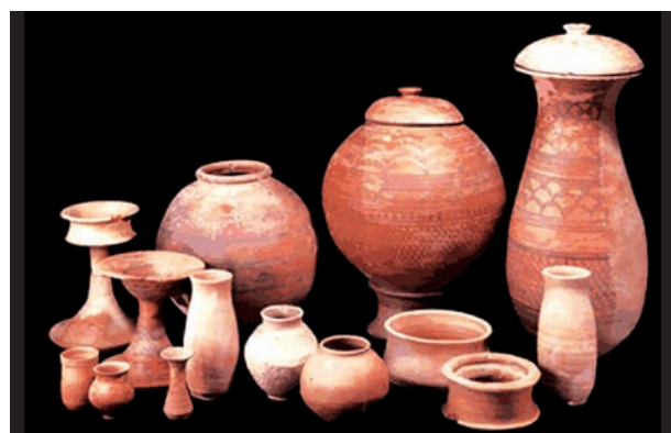
Harappan painted pottery

The Harappans used diverse varieties of pottery for daily use. They use well-fired pottery. Their potteries have a deep red slip and black paintings. The pottery are shaped like dish-on-stands, storage jars, perforated jars, goblets, S-shaped jars, plates, dishes, bowls and pots. The painted motifs, generally noticed on the pottery, are pipal leaves, fish-scale design,