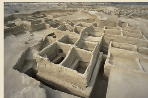
Mehrgarh Neolithic mud houses

From the Neolithic period, people began to eat ground grain and cooked food, which caused dental and other health problems. The earliest evidence for drilling human tooth (of a living person) has been found at Mehrgarh. It is seen as a prelude to dentistry.