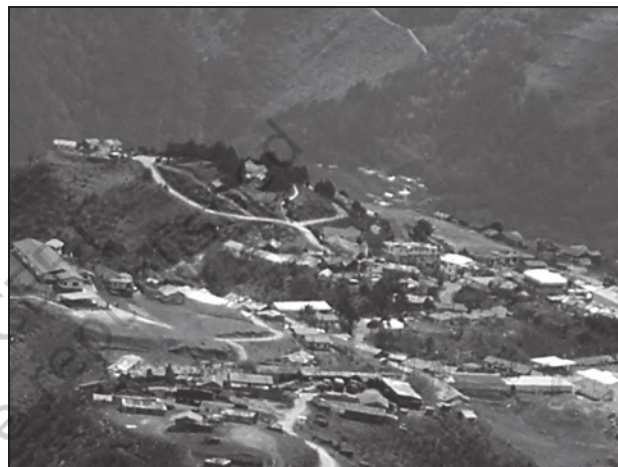
Fig. 4.2 : Semi-clustered settlements

Semi-clustered or fragmented settlements may result from tendency of clustering in a restricted area of dispersed settlement. More often such a pattern may also result from segregation or fragmentation of a large compact village. In this case, one or more sections of the village society choose or is forced to live a little away from the main cluster or village. In such cases, generally, the land-owning and dominant community occupies the central part of the main village, whereas people of lower strata of society and menial workers settle on the outer flanks of the village. Such settlements are widespread in the Gujarat plain and some parts of Rajasthan.