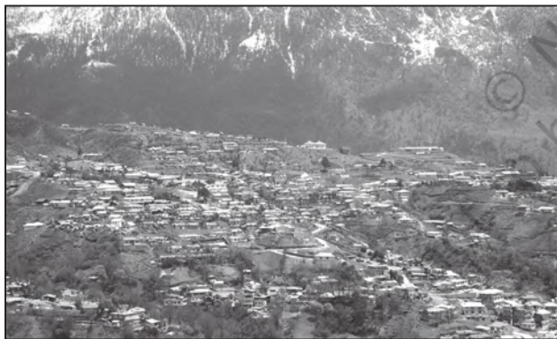
Fig. 4.1 : Clustered Settlements in the North-eastern states

The clustered rural settlement is a compact or closely built up area of houses. In this type of village the general living area is distinct and separated from the surrounding farms, barns and pastures. The closely built-up area and its