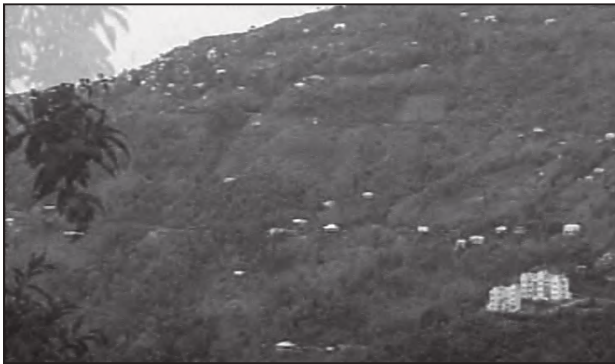
Fig. 4.3 : Dispersed settlements in Nagaland

with farms or pasture on the slopes. Extreme dispersion of settlement is often caused by extremely fragmented nature of the terrain and land resource base of habitable areas. Many areas of Meghalaya, Uttarakhand, Himachal Pradesh and Kerala have this type of settlement.