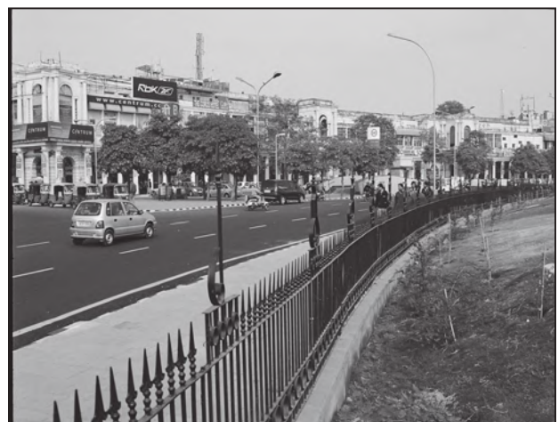
Fig. 4.4 : A view of the modern city

The British and other Europeans have developed a number of towns in India. Starting their foothold on coastal locations, they first developed some trading ports such as Surat, Daman, Goa, Pondicherry, etc. The British later consolidated their hold around three principal nodes – Mumbai (Bombay), Chennai (Madras), and Kolkata (Calcutta) – and built them in the British style. Rapidly