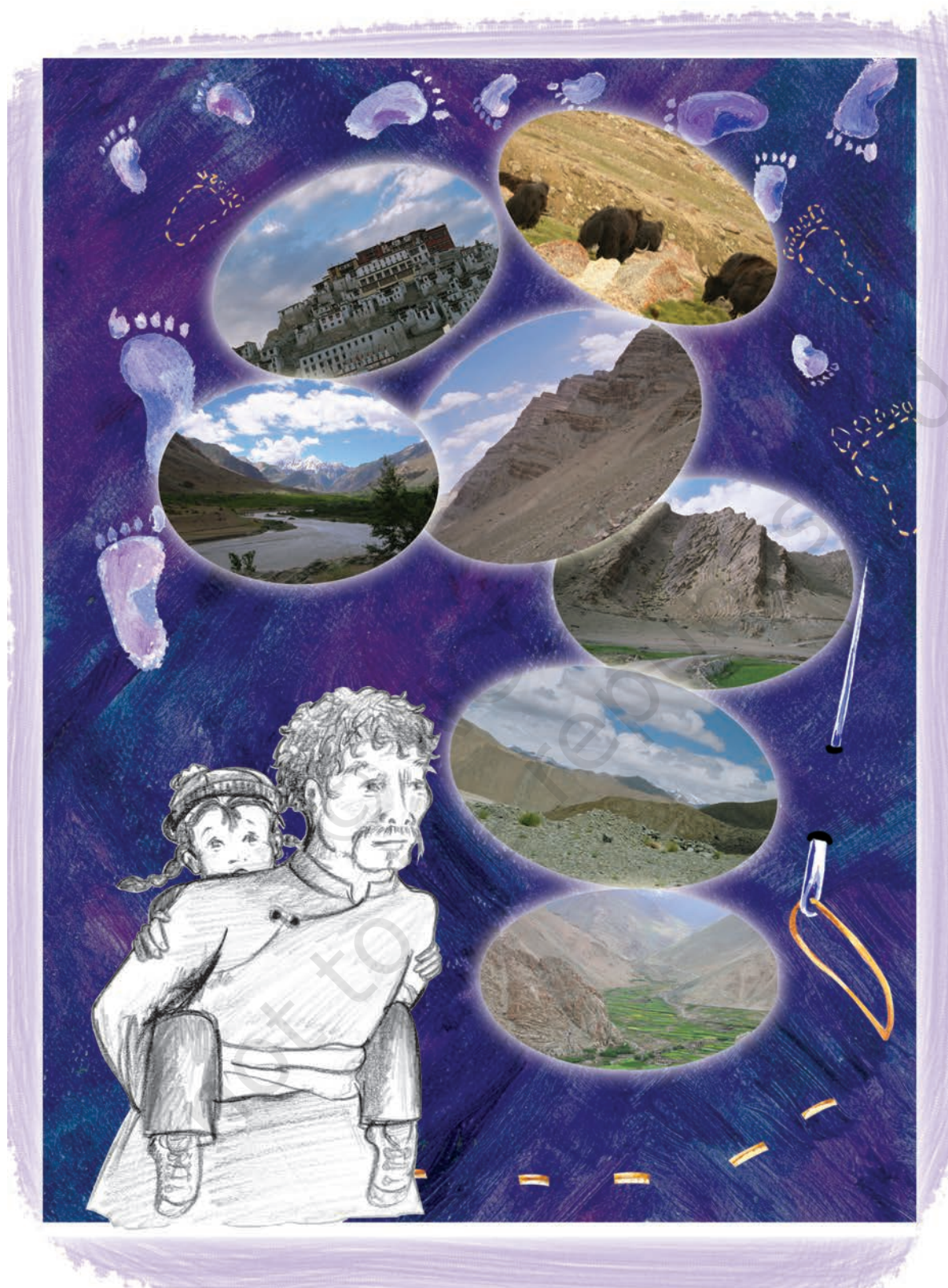
Chuskit amongst photographs from Ladakh