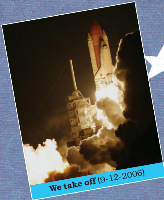
We take off (9-12-2006)