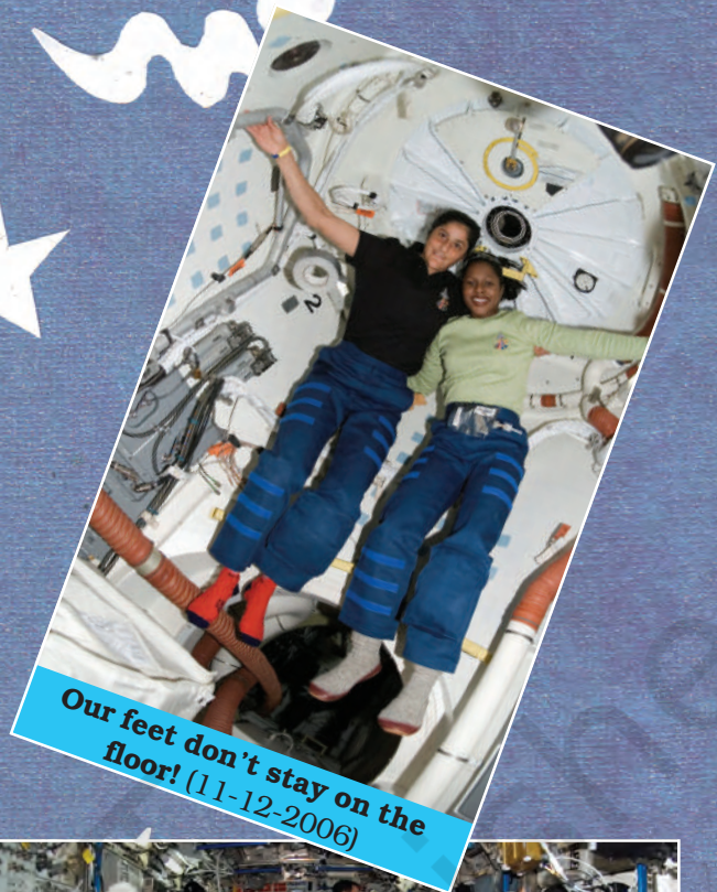
Our feet don't stay on the floor! (11-12-2006)