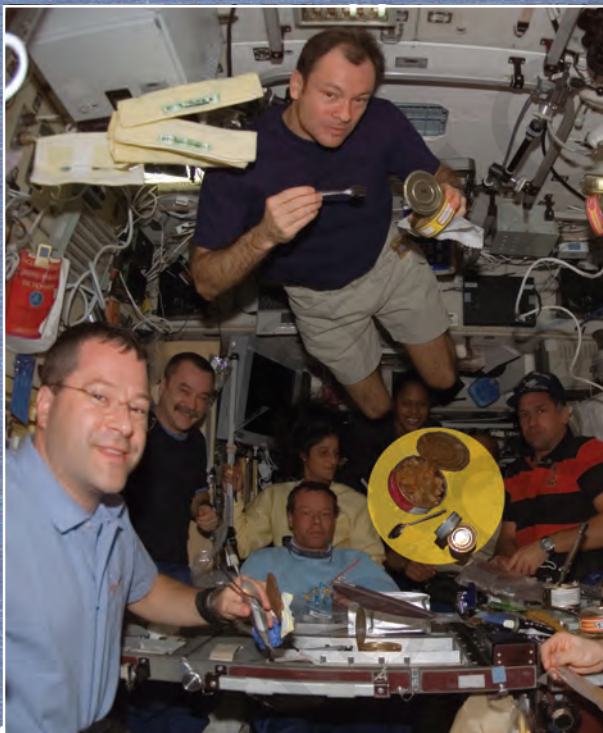
Where is this food flying away? (11-12-2006)