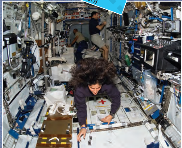
Look, my hair is standing, no problem while working (13-12-06)