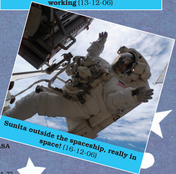
Sunita outside the spaceship, really in space! (16-12-06)