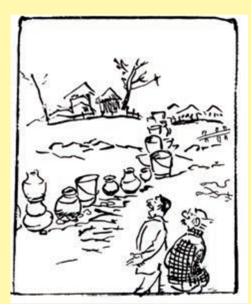
Not bad! One of the taps in the nearby village must be getting water!

What approval or disapproval is being expressed here?