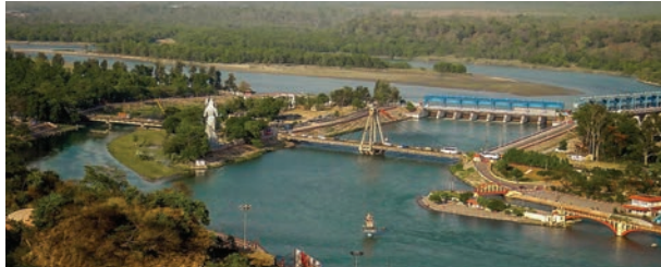
Ganga River - Haridwar

The length of the river Ganga is about 2,525 km. Its major tributaries from the north are Gomti, Gandak, Kosi and Ghaghra and from south, Yamuna (largest tributary of Ganga), Son, Chambal etc. The river Ganga is known as the River Padma in Bangladesh. The combined river of Ganga and Brahmaputra creates the World's largest delta known as Sundarbans in Bangladesh before joining the Bay of Bengal.