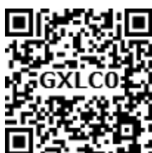
E - Book