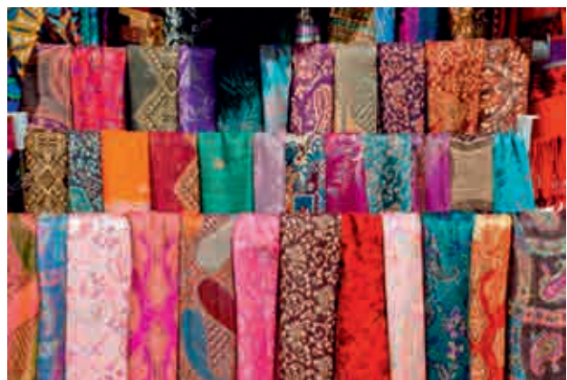
Picture No. 10.1 Pashaina of Kashmir