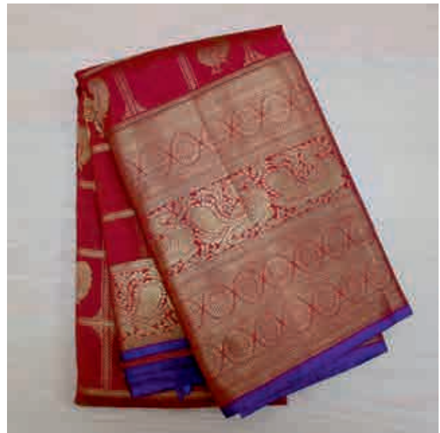
Picture No. 10.9 Kanchivaram

Motifs and Designs: Specialty of this Saree is solid border, solid body, solid pallu and small butta designs are used all over the body with golden and zari threads