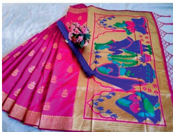
Picture No. 10.6 Paithani