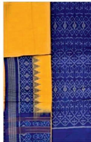
Pic. No. 10.4 (a) Ikat

“IKAT” Sarees are the handloom sarees of Orissa. Ikat Sarees is a made through a process of tie-dyeing the wrap and weft threads to create the design on the loom before weaving, it forms feathered edges and a hazy fragile appearance.