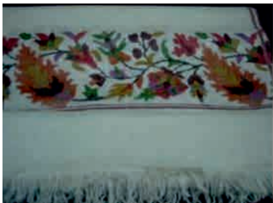
Picture No. 10.1 Pashaina of Kashmir