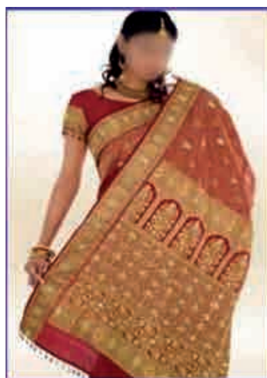
Pic. No. 10.2 Brocades

Colors Used are of golden or silver zari and nowadays of metallic threads with maroon, blue, green, or bright colours.