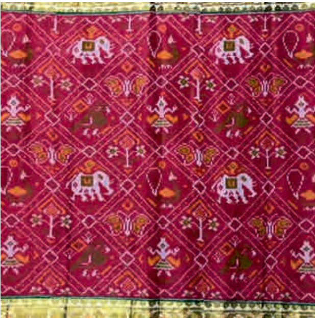
Picture No. 10.7 Patola

Motifs Used: - are stylized animals like elephant, camels, tigers, birds, flowers in symmetrical motifs, dancing women and pen.