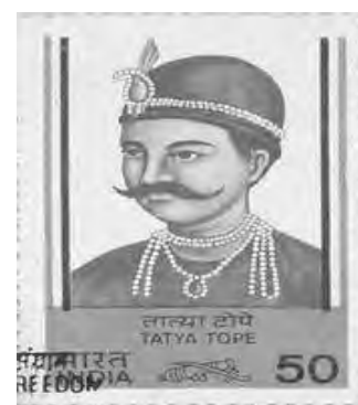
Fig. 13 – Postal stamp Issued in commemoration of Tantia Tope

Just as victories against the British had earlier encouraged rebellion, the defeat of rebel forces encouraged desertions. The British also tried their best to win back the loyalty of the people. They announced rewards for loyal landholders would be allowed to continue to enjoy traditional rights over their lands. Those who had rebelled were told that if they submitted to the British, and if they had not killed any white people,