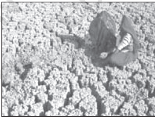
Fig. 5.5 : Soil Moisture Loss

Drought has been recognised as one of the main causes of human misery. While generally associated with semi-arid or desert conditions, drought can occur in areas that normally enjoy adequate rainfall and moisture levels. In the broadest sense, any lack of water for the normal needs of agriculture, livestock, industry, or human population may be termed a drought. The cause may be lack of supply, pollution of the water, inadequate storage, conveyance facilities, or abnormal demand.