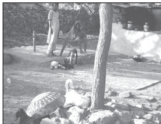
Fig. 5.1 : A Poverty-ridden family

If the problem pertains to chronic poverty, the study should be based on average conditions or reflecting responses with references to normal rainfall year for the