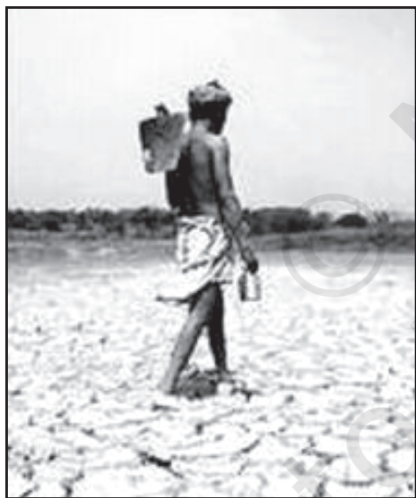
Fig. 5.4 : Drought-affected Area

Drought, as commonly understood, is a condition of climatic dryness that is severe enough to reduce soil moisture and water below the minimum limit necessary for sustaining plant, animal and human life (Fig 5.4 and 5.5). It is usually accompanied by hot dry winds and may be followed by damaging floods.