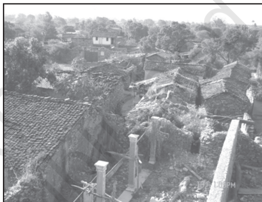
Fig. 5.2 : A Poverty-ridden Village