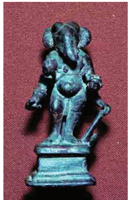
Ganesh, seventh century CE, Kashmir