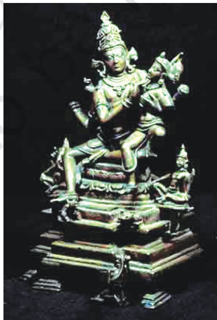
Shiva Family, tenth century CE, Bihar

Many standing Buddha images with right hand in abhaya mudra were cast in North India, particularly Uttar Pradesh and Bihar, during the Gupta and Post-Gupta periods, i.e., between the fifth, sixth and seventh centuries. The sanghati or the monk's robe is wrapped to cover the shoulders which turns over the right arm, while the other