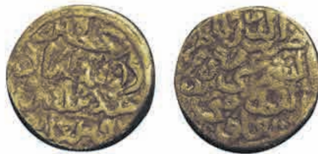
Coins of Muhammad-bin-Tughluq

During the Sultanate period there were major changes in coinage system. Instead of images of deities on the coins, the names of the Khalifa and the Sultan were inscribed on the coins. Details regarding the year of issue, place of minting etc. were inscribed on it in the Arabic script. ‘Tola’ came to be considered