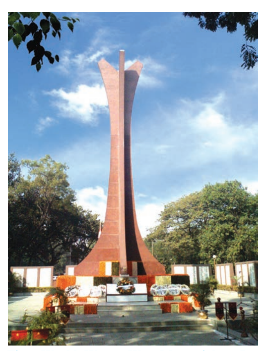
First World War - War Memorial at Pune

World War I left significant impact on various fields including production of war supplies, civil industries, trade, economic policies, sea and land transportation, farming and agricultural production, fuel supply, defence systems, etc. This war boosted India's industrial growth. The direct and indirect impacts of the war were more evident in fields like iron industry, steel industry, coal and mining industries. After the war was over, there was considerable growth in motor transportation and the number of motor vehicles. During war times and post-war period there was decrease in the export amounting to a loss of Rs.33 approximately. The crores. prices agricultural products reduced but the prices of industrial products increased. Indian food grains were exported to England and allied nations. It caused a shortage of food grains for the Indians. Prices of food grains in Indian markets began to rise.