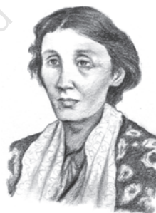
Virginia Woolf 1882-1941

This essay records fleeting impressions and delicate shades of mental experience.