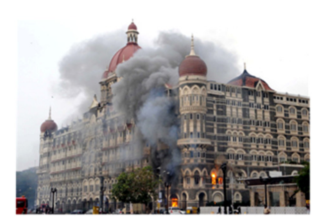
Figure 27.1 Terrorist Attack in Mumbai

Terrorism has been one of the greatest threats to peace and security in our country. The illustration on the terrorist attack in Mumbai on 26 November, 2008, popularly called 26/11, symbolizes one of the worst such incidences. Have you not been shocked by these kinds of terrorist attacks in several cities that have occurred almost at regular intervals in recent past? In fact, such activities have been happening since independence in various parts of the country. The terrorists who conduct violent activities are persons belonging to foreign countries or are Indian youth indoctrinated, supported and trained in neighbouring countries. At times, we are confused about defining terrorist activities. In fact, there is no consensus on the definition of terrorism. However, in general terms and in the context of India, we may define terrorism as essentially a criminal act to inflict dramatic and deadly injury on civilians and to create an atmosphere of fear, generally for a political or ideological purpose. Terrorism is a criminal act, but it is more than mere criminality. These acts are in any circumstance unjustifiable, whatever the considerations of a political, philosophical, ideological, racial, ethnic, religious or any other nature that may be invoked to justify them.