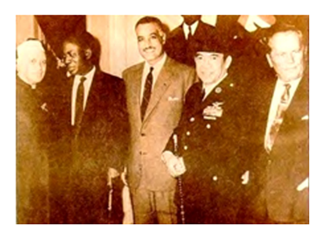
Figure 27.3 Nehru, Nkrumah, Nasser and Tito (L to R); Leaders of NAM

Since Non-aligned Movement NAM was a product of the cold war scenario and the bipolar world, many scholars questioned the relevance of NAM after the end of cold war and disintegration of the Soviet Union. However, even in the present scenario NAM has a significant role to play. First, with the disintegration of Soviet Union, the world faces a threat from unipolar world. The NAM can act as a check against US dominance. Secondly, the developed (North) and developing (South) world are divided over several economic issues. The NAM remains a very relevant forum for developing countries to engage with the developed nations in a productive dialogue. Moreover, the NAM can prove to be powerful instrument for South-South cooperation. Such a thing is essential if the developing countries are to increase their bargaining power vis-a-vis the developed world. Finally, the developing countries united under the banner of NAM have to fight for the reform of UN and change it according to the requirements of the 21st century.