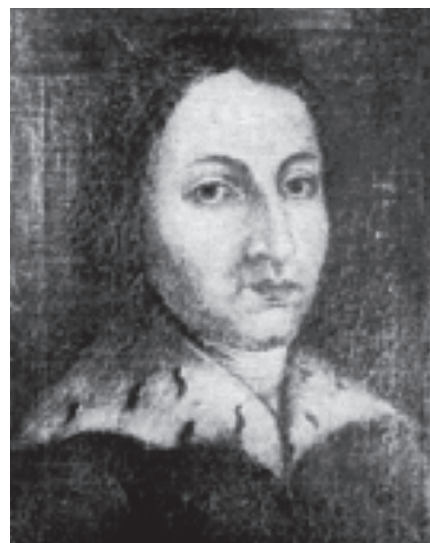
Self-portrait by Copernicus.

Celestial means divine or heavenly, while terrestrial implies having a worldly quality.