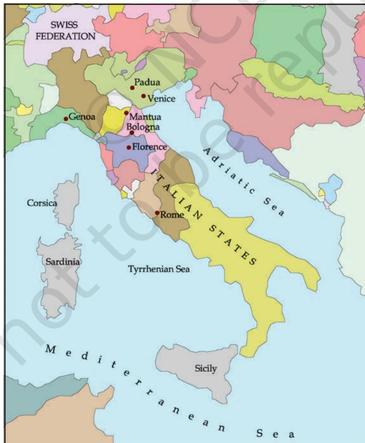
MAP 1: The Italian States

With the expansion of trade between the Byzantine Empire and the Islamic countries, the ports on the Italian coast revived. From the twelfth century, as the Mongols opened up trade with China via the Silk Route (see Theme 5) and as trade with western European countries