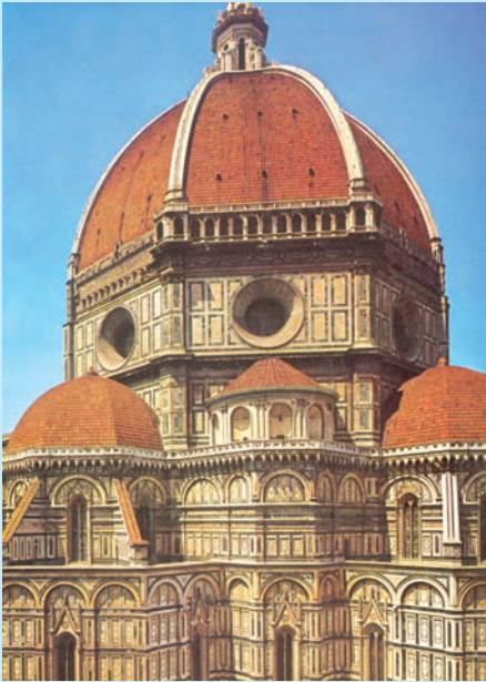
The Duomo, the dome of Florence cathedral designed by Brunelleschi.

Another remarkable change was that from this time, artists were known individually, by name, not as members of a group or a guild, as earlier.