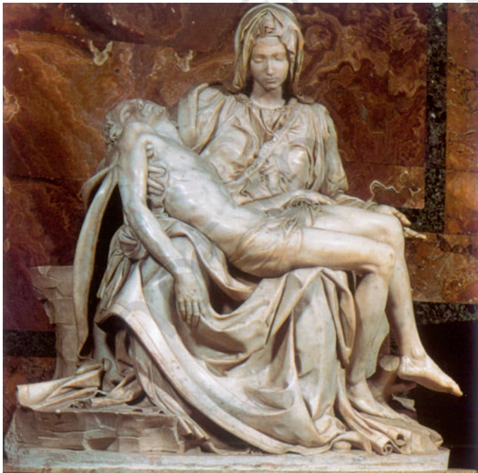
‘The Pieta’ by Michelangelo depicts Mary holding the body of Jesus.

Artists were inspired by studying works of the past. The material remains of Roman culture were sought with as much excitement as ancient texts: a thousand years after the fall of Rome, fragments of art were discovered in the ruins of ancient Rome and other deserted cities. Their admiration for the figures of ‘perfectly’ proportioned men and women sculpted so many centuries ago, made Italian sculptors want to continue that tradition. In 1416, Donatello (1386-1466) broke new ground with his lifelike statues.