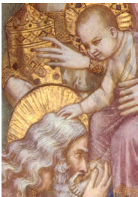
Giotto's painting of the child Jesus, Assisi, Italy.

Humanists thought that they were restoring 'true civilisation' after centuries of darkness, for they believed that a 'dark age' had set in after the collapse of the Roman Empire. Following them, later scholars unquestioningly assumed that a 'new age' had begun in Europe from the fourteenth century. The term 'Middle Ages'/'medieval period' was