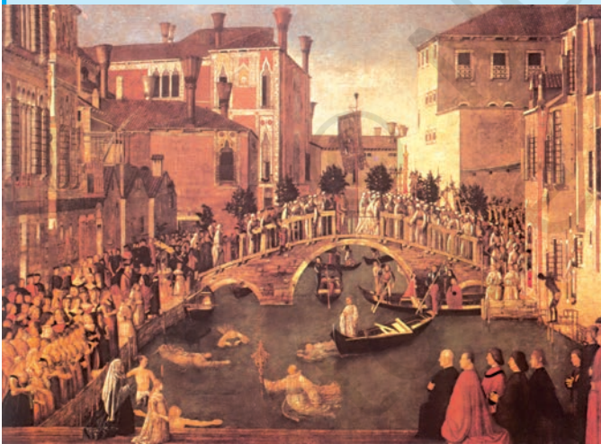
G. Bellini's 'The Recovery of the Relic of the Holy Cross' was painted in 1500, to recall an event of 1370, and is set in fifteenth-century Venice.

Now first I am to yield you a reckoning how and with what wisdom it was ordained by our ancestors, that the common people should not be admitted into this company of citizens, in whose