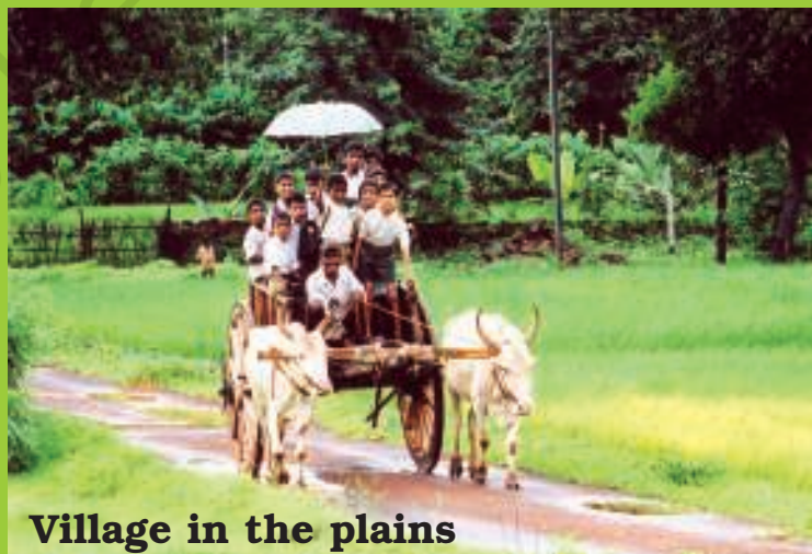
Village in the plains

We ride in our bullock-cart, going slowly through the green fields. If it is too sunny or raining, we use our umbrellas.