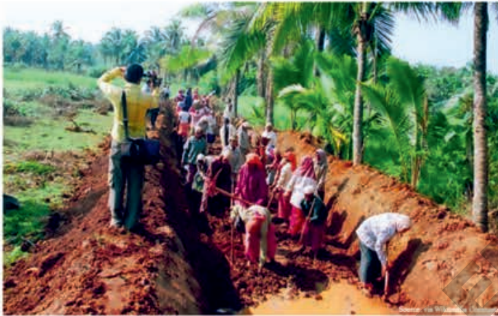
Labour at work under NREGA

At the same time the District Administration is taking up necessary steps to provide these facilities through Food Corporation of India (FCI), Co-operative Societies and Fair Price Shops. The government also take up special measures to provide food items to all sections of people, rich or poor during situations like war and revolutions, natural calamities like flood, earthquake and drought, etc. Scarcity of foodstuffs lead to price rise, adulteration of food and artificial food crises. Therefore it is the duty of the government to have a rich stock of quality food. Production and storage of food items according to the size of populaton and distrubution of the same in time and need is called 'Food safety'. Food safety is necessary for human resource developement.