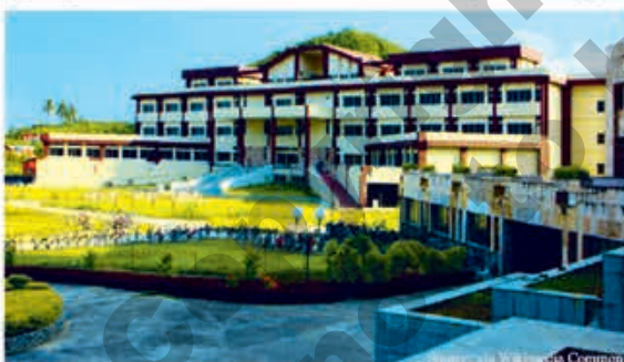
Indian Institute of Technology, Guwahati

The role of the government in the growth and development of its human resource is boundless. The project and schemes adopted and implemented by the government determines the rate of growth and development of human resource. Let us now briefly discuss on the various programmes and areas which speeds up human resource development.