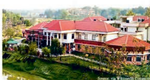
National Institute of Technology, Silchar

Right to education is our fundamental right. Development of human resource is impossible without the development of education. It is the duty of the government to provide a proper educational infrastructure. In order to fulfil this duty the government is try-