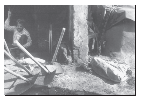
Work and Home