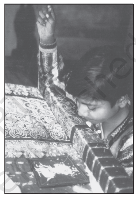
Discuss the visual

The report indicates how gender and caste discrimination impinge upon the chances of education. Recall how we began this book in Chapter 1 about a child's chances for a good job