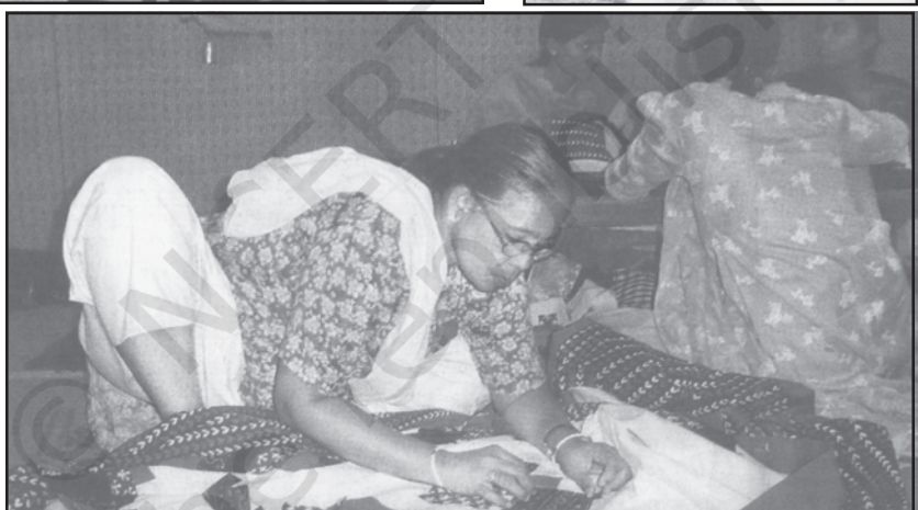
Types of Work

physical effort, which has as its objective the production of goods and services that cater to human needs.