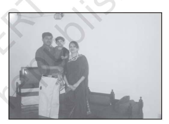
Notice how families and residences are different