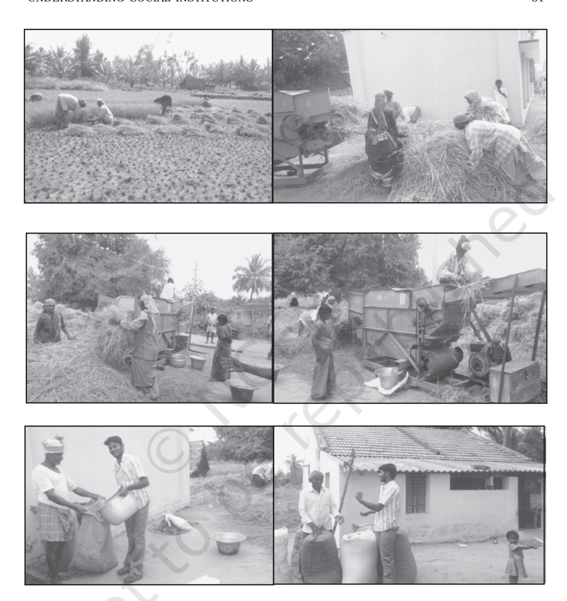
Threshing of paddy in a village