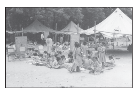
Discuss the visuals (Two types of schools)

For the sociologists who perceive society as unequally differentiated, education functions as a main