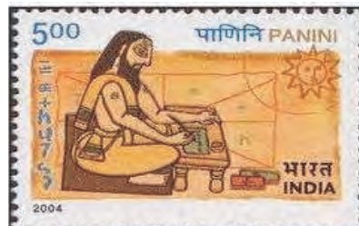
Postage stamp of Indian grammarian, Panini

Takshashila became famous as a place of learning due to its teachers' expertise. Among its noted pupils were the legendary Indian grammarian, Panini. He was an expert in language and grammar and authored one of the greatest works on grammar called Ashtadhyayi . Jivaka, one of the most renowned physicians in ancient India, and Chanakya (also known as Kautilya), a skilled exponent of statecraft, both studied here. Students came to Takshashila from Kashi, Kosala, Magadha and also from other countries in spite of the long and arduous journey they had to undertake.