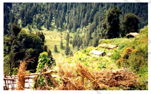
Figure 16.2 A view of a forest life

Do you think such use of forest resources would lead to the exhaustion of these resources? Do not forget that before the British came and took over most of our forest areas, people had been living in these forests for centuries. They had developed practices to ensure that the resources were used in a sustainable manner. After the British took control of the forests (which they exploited ruthlessly for their own purposes), these people were forced to depend on much smaller areas and forest resources started becoming over-exploited to some extent. The Forest Department in independent India took over from the British but local knowledge and local needs continued to be ignored in the management practices. Thus vast tracts of forests have been converted to monocultures of pine, teak or eucalyptus. In order to plant these trees, huge areas are first cleared of all vegetation. This destroys a large amount of biodiversity in the area. Not only this, the varied needs of the local people – leaves for fodder, herbs for medicines, fruits and nuts for food - can no longer be met from such forests. Such plantations are useful for the industries to access specific products and are an important source of revenue for the Forest Department.