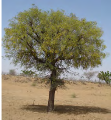
Figure 16.3 Khejri Tree

environmentally and developmentally sound – in other words, while the environment is preserved, the benefits of the controlled exploitation go to the local people, a process in which decentralised economic growth and ecological conservation go hand in hand. The kind of economic and social development we want will ultimately determine whether the environment will be conserved or further destroyed. The environment must not be regarded as a pristine collection of plants and animals. It is a vast and complex entity that offers a range of natural resources for our use. We need to use these resources with due caution for our economic and social growth, and to meet our material aspirations.