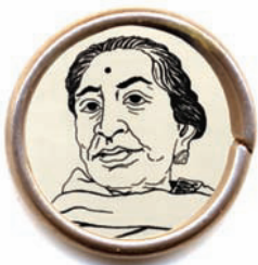
Sarojini Naidu (1879-1949) born: Andhra Pradesh. Poet, writer and political activist. Among the foremost women leaders in the Congress. Later: Governor of Uttar Pradesh.