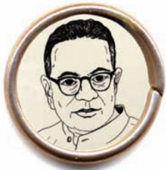
T.T. Krishnamachari (1899-1974)

born: Uttar Pradesh. Educationist, author and theologian; scholar of Arabic. Congress leader, active in the national movement. Opposed Muslim separatist politics. Later: Education Minister in the first union cabinet.