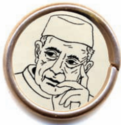
Jawaharlal Nehru (1889-1964) born: Uttar Pradesh. Prime Minister of the interim government. Lawyer and Congress leader. Advocate of socialism, democracy and anti-imperialism. Later: First Prime Minister of India.