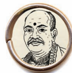
Shyama Prasad Mukherjee

(1891-1956) born: Maharashtra. Chairman of the Drafting Committee. Social revolutionary thinker and agitator against caste divisions and caste based inequalities. Later: Law minister in the first cabinet of post-independence India. Founder of Republican Party of India.