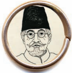
Abul Kalam Azad (1888-1958)

born: Uttar Pradesh. Educationist, author and theologian; scholar of Arabic. Congress leader, active in the national movement. Opposed Muslim separatist politics. Later: Education Minister in the first union cabinet.