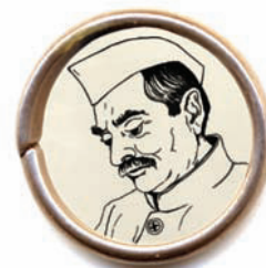
Rajendra Prasad (1884-1963) born: Bihar. Chairman of the Constituent Assembly. Lawyer, known for his role in the Champaran satyagraha. Three times the president of Congress. Later: the first President of India.

The second reason for accepting the Constitution is that the Constituent Assembly represented the people of India. There was no universal adult franchise at that time. So the Constituent Assembly could not have been chosen directly by all the people of India. It was