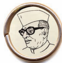
Kanhaiyalal Maniklal Munshi

Constituent Assembly at the stroke of midnight on August 15, 1947: