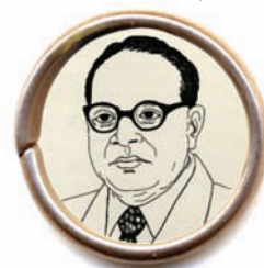
Bhimrao Ramji Ambedkar

(1887-1971) born: Gujarat. Advocate, historian and linguist. Congress leader and Gandhian. Later: Minister in the Union Cabinet. Founder of the Swatantra Party.