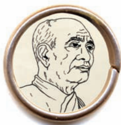
Jhaverbhai Vallabhai Patel

(1875-1950) born: Gujarat. Minister of Home, Information and Broadcasting in the Interim Government. Lawyer and leader of Bardoli peasant satyagraha. Played a decisive role in the integration of the Indian princely states. Later: Deputy Prime Minister.