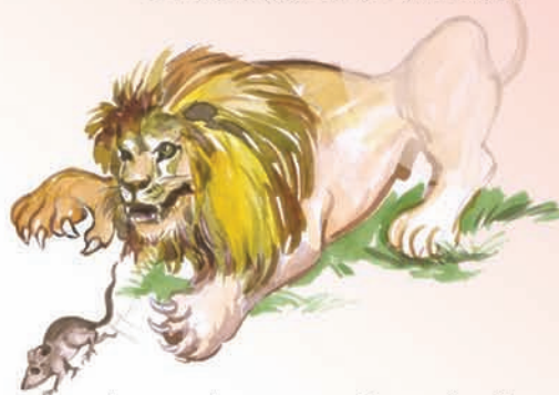
The mouse is running away from the lion.