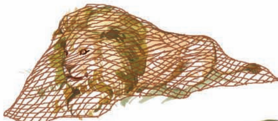
The lion is in the net.