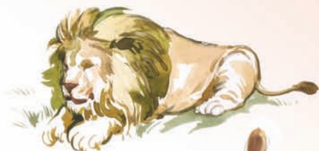
The lion is sleeping.