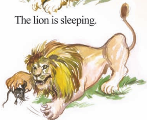
The lion caught the mouse.