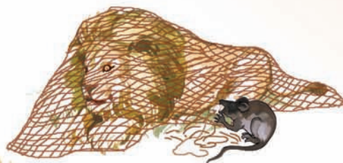
The mouse cut the net.