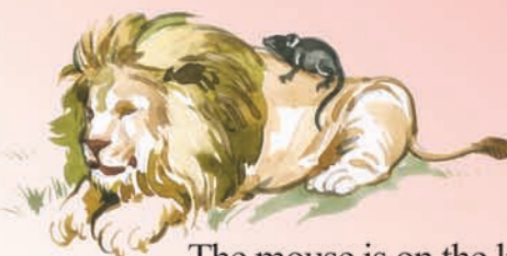
The mouse is on the lion.