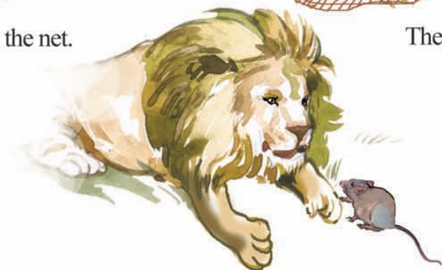
The mouse and the lion are now friends.