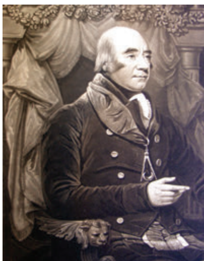
Fig. 11 – Lord Hastings