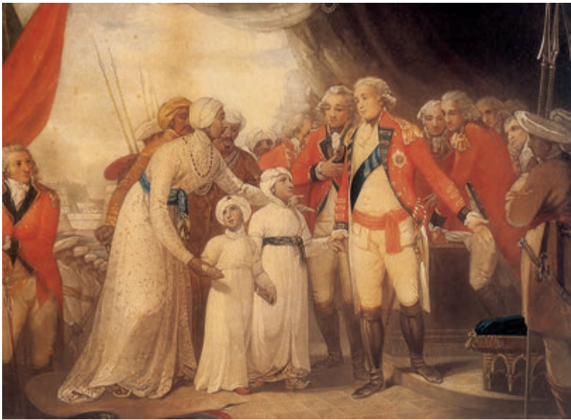
Fig. 9 – Cornwallis receiving the sons of Tipu Sultan as hostages, painted by Daniel Orme, 1793

The Company forces were defeated by Haidar Ali and Tipu Sultan in several battles. But in 1792, attacked by the combined forces of the Marathas, the Nizam of Hyderabad and the Company, Tipu was forced to sign a treaty with the British by which two of his sons were taken away as hostages. British painters always liked painting scenes that showed the triumph of British power.