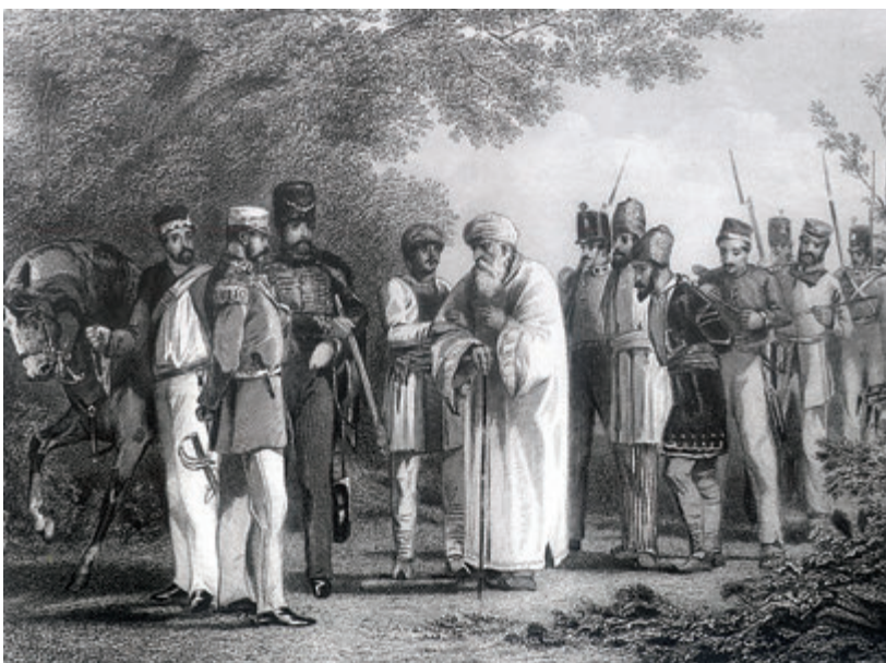
Fig. 1 – Bahadur Shah Zafar and his sons being arrested by Captain Hodson

By the second half of the eighteenth century, however, a new power was emerging on the political horizon – the British. Did you know that the British originally came as a small trading company and were reluctant to acquire territories? How then did they come to be masters of a vast empire? In this chapter you will see how this came about.