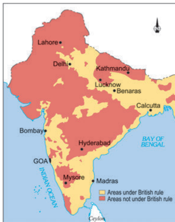
Fig. 14 b – India, 1840