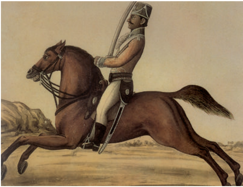
Fig. 16 – A sawar of Bengal in the service of the Company, painted by an unknown Indian artist, 1780

After the battles with the Marathas and the Mysore rulers, the Company realised the importance of strengthening its cavalry force.