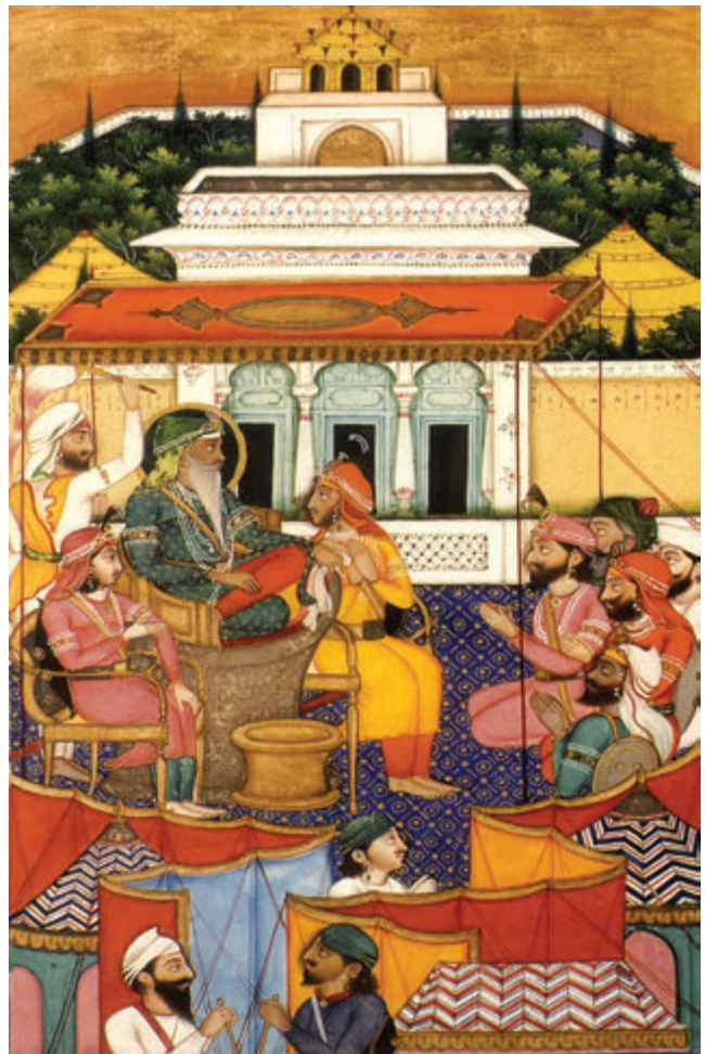
Fig. 13 – Maharaja Ranjit Singh holding court

Imagine that you are a nawab’s nephew and have been brought up thinking that you will one day be king. Now you find that this will not be allowed by the British because of the new Doctrine of Lapse. What will be your feelings? What will you plan to do so that you can inherit the crown?