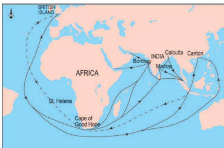
Fig. 2 – Routes to India in the eighteenth century

Mercantile – A business enterprise that makes profit primarily through trade, buying goods cheap and selling them at higher prices