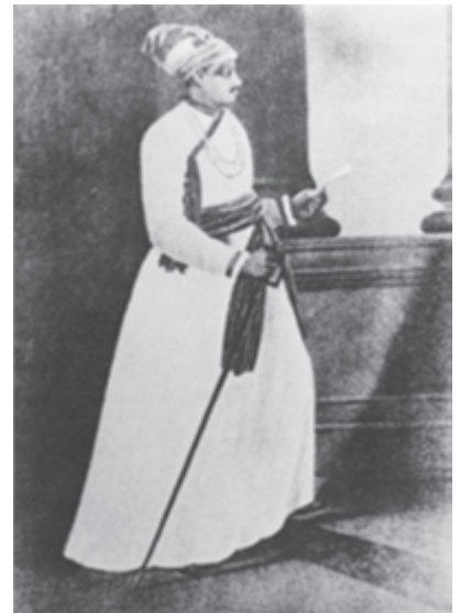
Fig. 6 – Sirajuddaulah

The Battle of Plassey became famous because it was the first major victory the Company won in India.