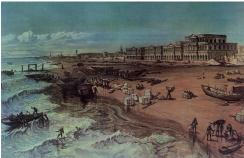
Fig. 3 – Local boats bring goods from ships in Madras, painted by William Simpson, 1867