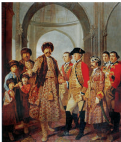
Fig. 7 – Nawab Shujauddaulah of Awadh, with his sons and the British Resident, painted by Tilly Kettle (oil, 1772)

The treaties that followed the Battle of Buxar forced Nawab Shujauddaulah to give up much of his authority. Here, however, he poses in regal splendour, towering over the Resident.