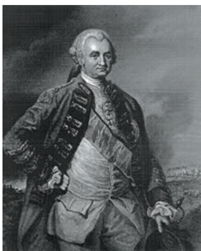
Fig. 4 – Robert Clive

Puppet – Literally, a toy that you can move with strings. The term is used disapprovingly to refer to a person who is controlled by someone else.