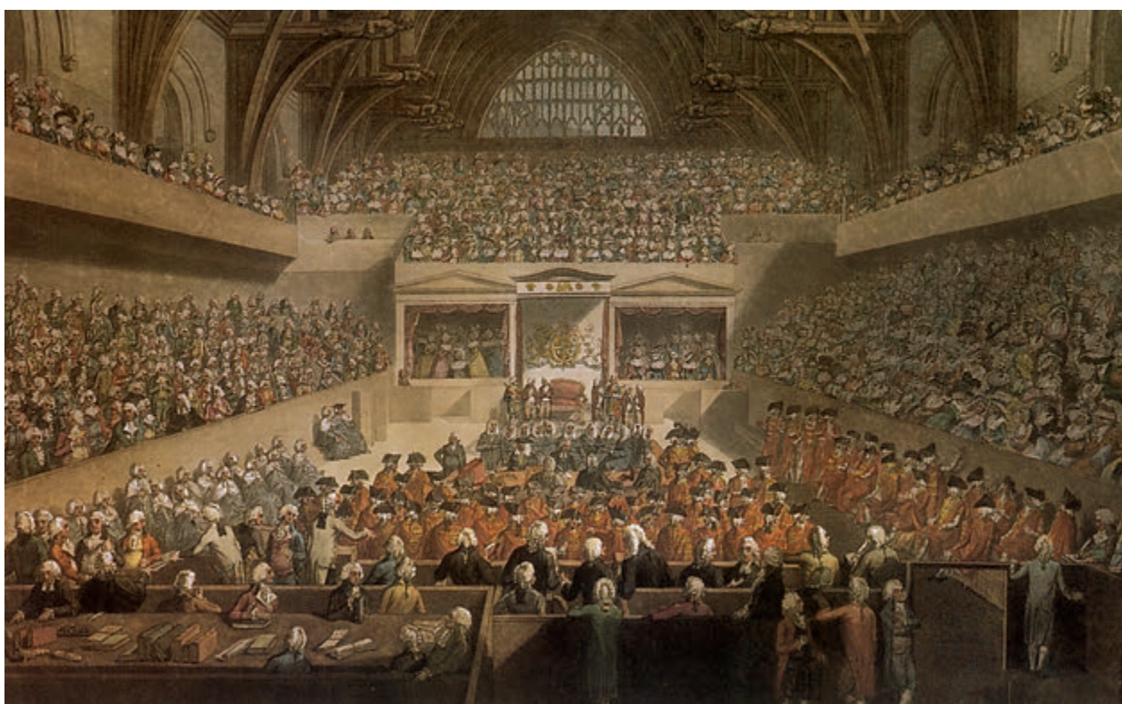
Fig. 15 – The trial of Warren Hastings, painted by R.G. Pollard, 1789

Impeachment – A trial by the House of Lords in England for charges of misconduct brought against a person in the House of Commons