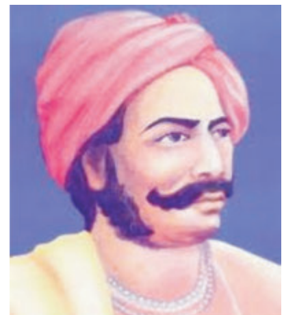
Fig. 14 – A portrait of Veer Surendra Sai