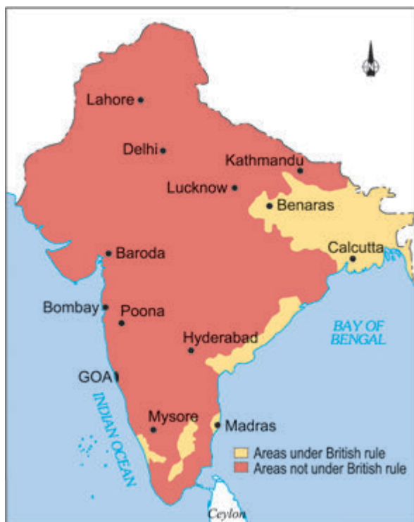
Fig. 14 a – India, 1797