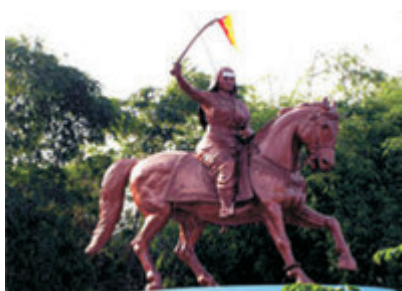
Fig. 12 – A Statue of the Queen of Kitoor (Karnataka)