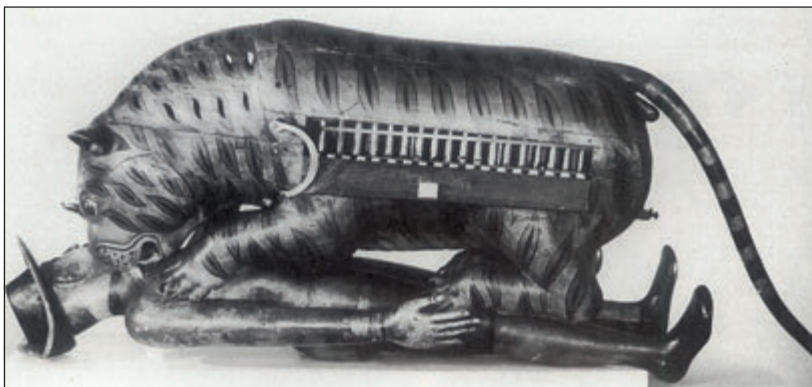
Fig. 10 – Tipu's toy tiger

The British were furious. They saw Haidar and Tipu as ambitious, arrogant and dangerous – rulers who had to be controlled and crushed. Four wars were fought with Mysore (1767-69, 1780-84, 1790-92 and 1799). Only in the last – the Battle of Seringapatam – did the Company ultimately win a victory. Tipu Sultan was killed defending his capital Seringapatam, Mysore was placed under the former ruling dynasty of the Wodeyars and a subsidiary alliance was imposed on the state.