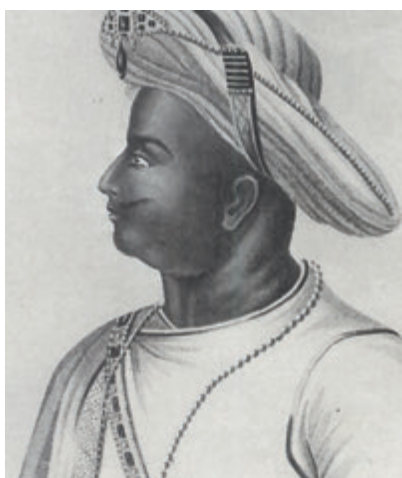
Fig. 8 – Tipu Sultan

had to pay for the “subsidiary forces” that the Company was supposed to maintain for the purpose of this protection. If the Indian rulers failed to make the payment, then part of their territory was taken away as penalty. For example, when Richard Wellesley was Governor-General (1798-1805), the Nawab of Awadh was forced to give over half of his territory to the Company in 1801, as he failed to pay for the “subsidiary forces”. Hyderabad was also forced to cede territories on similar grounds.