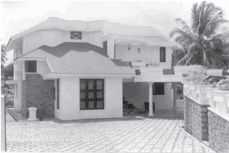
Look at this house 'Sukrutham' in a village in Kerala. It is located in Yakkar Village, 3 kilometres from Palakkad district town