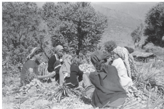
Cultivation in different parts of the country