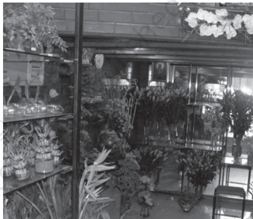
Farming of Flowers

Another, and more widespread aspect of the globalisation of agriculture is the entry of multinationals into this sector as sellers of agricultural inputs such as seeds, pesticides, and fertilisers. Over the last decade or so, the government has scaled down its agricultural development programmes, and 'agricultural extension' agents have been replaced in the villages by agents of seed, fertiliser, and pesticide companies. These agents are often the sole source of information for farmers about new seeds or cultivation practices, and of course they have an interest in selling their products. This has led to the increased dependence of farmers on expensive fertilisers and pesticides, which has reduced their profits, put many farmers into debt, and also created an ecological crisis in rural areas.