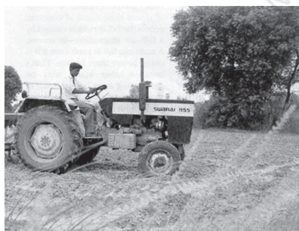
Changing technologies in agriculture