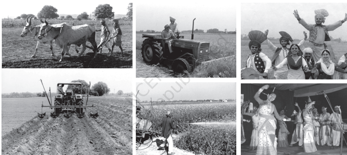
Different means of agriculture and related festivals.

Indian society is primarily a rural society though urbanisation is growing. The majority of India's people live in rural areas (69 per cent, according to the 2011 Census). They make their living from agriculture or related occupations. This means that agricultural land is the most important productive resource for a great many Indians. Land is also the most important form of property. But land is not just a 'means of production' nor just a 'form of property'. Nor is agriculture just a form of livelihood. It is also a way of life. Many of our cultural practices and patterns can be traced to our agrarian backgrounds. You will recall from the earlier chapters how closely interrelated structural and cultural changes are. For example, most of the New Year festivals in different regions of India – such as Pongal in Tamil Nadu, Bihu in Assam, Baisakhi in Punjab and Ugadi in Karnataka to name just a few – actually celebrate the main harvest season and herald the beginning of a new agricultural season. Find out about other harvest festivals.