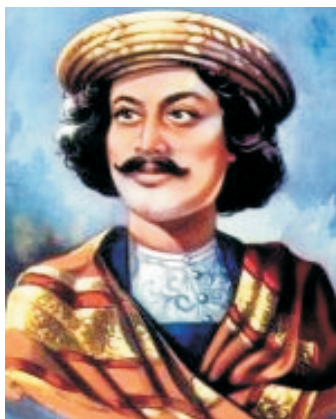
Raja Ram Mohan Roy 1772.

The man of multifaceted talent Raja Ram Mohan Roy was the Pioneer Person for the movements of Social and Religious reforms in India. He is also called the pillar of Indian Nationalism. He was born in Radha Nagar Village of Bengal, on 22 nd May