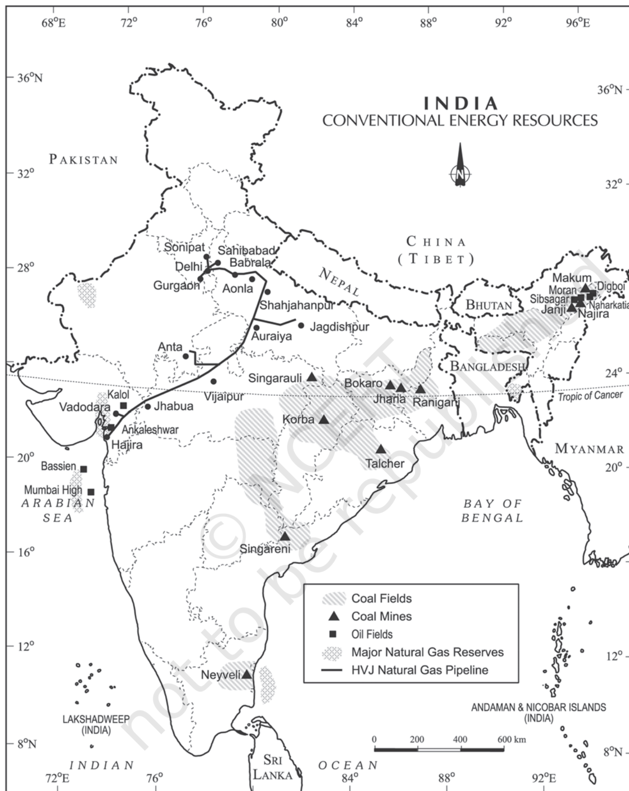
Fig. 7.5 : India – Conventional Energy Resources