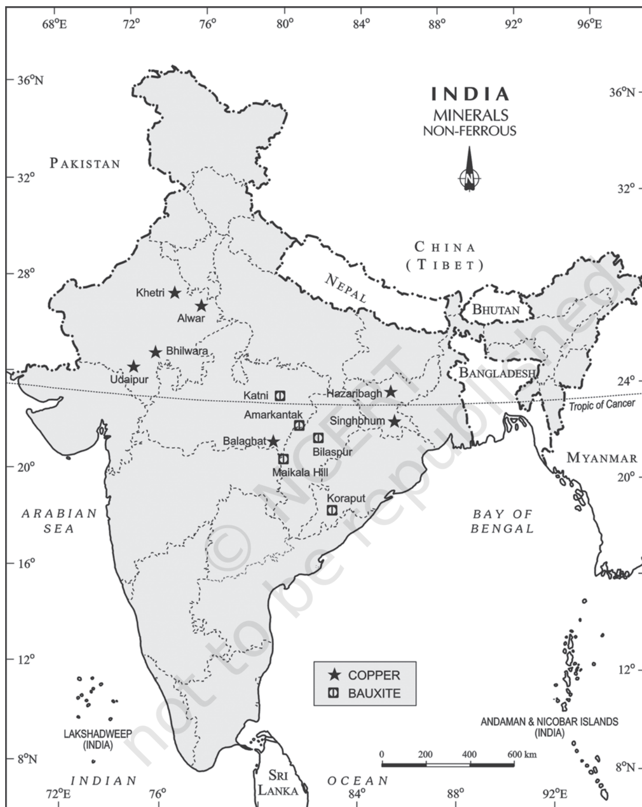
Fig. 7.3 : India – Minerals (Non-Ferrous)