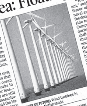
POWER OF FUTURE: Wind turbines in Dronten, the Netherlands

Offshore wind turbines are not new, but they typically stand on towers that have to be driven deep into the ocean floor. This arrangement only works in water depths of about 50 feet or less—close enough to shore that they are still visible. Researchers at the Massachusetts Institute of Technology and the National Renewable Energy Laboratory (NREL) have designed a wind turbine platform attached to a floating steel cable system on a