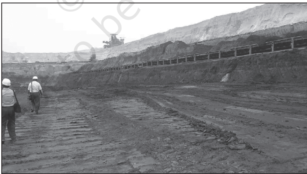
Fig.7.4 : Neyveli Coalfield