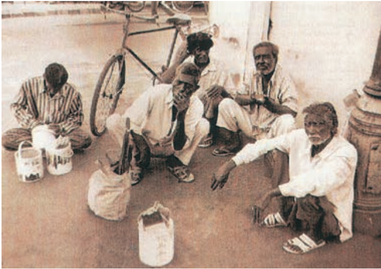
At labour chowk, daily wage workers wait with their tools for people to come and take them for work.

trucks in the market, dig pipelines and telephone cables and also build roads. There are thousands of such casual workers in the city.