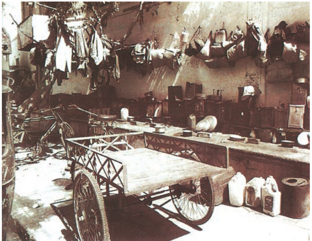
Often workers who make a living in the city are forced to set up their homes on the street as well. Below is a space where several workers leave their belongings during the day and cook their meals at night.

Vendors sell things that are often prepared at home by their families who purchase, clean, sort and make them ready to sell. For example, those who sell food or snacks on the street, prepare most of these at home.