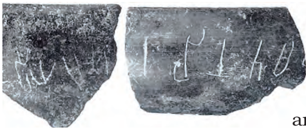
Tamil-Brahmi inscriptions. Several pieces of pottery have inscriptions in Brahmi, which was used to write Tamil.

Small tanks have been found that were probably dyeing vats, used to dye cloth. There is plenty of evidence for the making of beads from semi-precious stones and glass.