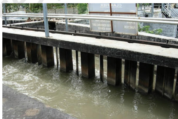
Fig. 18.4 Grit and sand removal tank