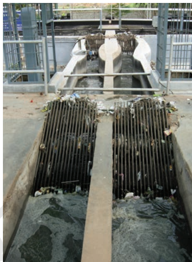
Fig. 18.3 Bar screen