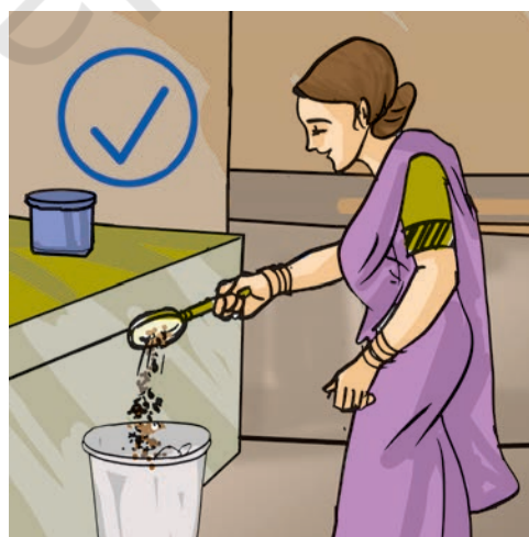
Fig. 18.7 Do not throw everything in the sink