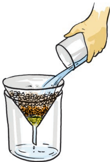
Fig. 18.2 Filtration process