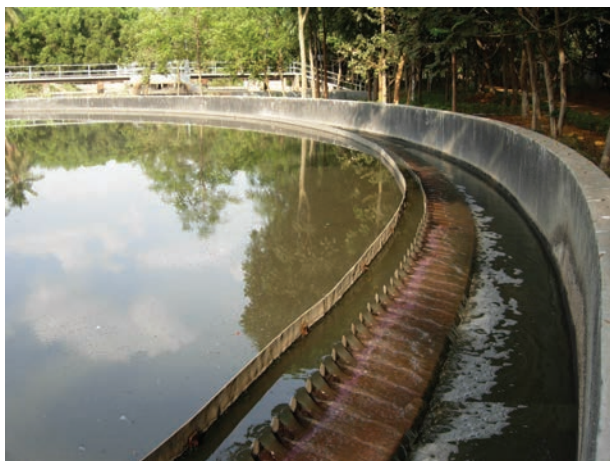
Fig. 18.5 Water clarifier

a scraper. This is the sludge . A skimmer removes the floatable solids like oil and grease. Water so cleared is called clarified water (Fig. 18.5).