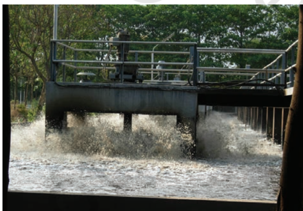
Fig. 18.6 Aerator

After several hours, the suspended microbes settle at the bottom of the tank as activated sludge. The water is then removed from the top.